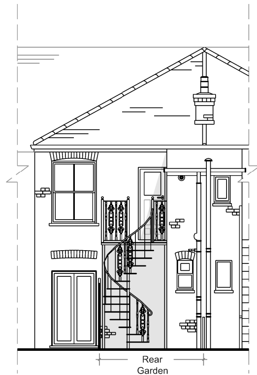
02 PROPOSED REAR ELEVATION 002 SCALE 1:100@A3