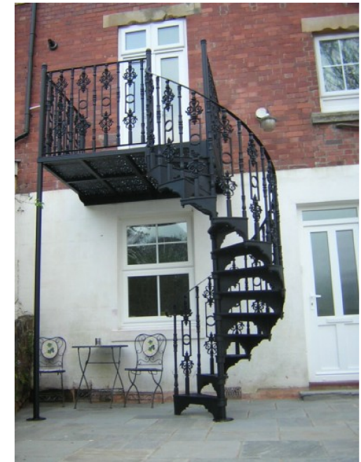
05 SAMPLE PHOTO OF SIMILAR SPIRAL STAIRS WITH PLATFORM 002 NOT TO SCALE

Disclaimer This drawing has been prepared solely for assistance in the preparation of details for planning only. It is important to note that this material is not intended to be used for construction purposes. The information contained herein serves as a reference and guide to understand the intended design concept. We expressly disclaim any responsibility or liability for any damages, losses, or errors resulting from the use or reliance upon this material for actual construction. Any unauthorized use, reproduction, or dissemination of this documentation, in part or in whole, without our explicit written consent, is strictly prohibited. To be read in conjunction with all other relevant drawings and specifications. This drawing does not indicate or imply the structural condition of the existing property. All levels and dimensions are to be checked on site and any discrepancies are to be brought to the immediate attention of the Architect/CA. Do not scale off this drawing. Structural Design and Building Control approval is required before construction commences. All workmanship and materials to be installed and carried out in accordance with the latest and relevant British Standards as a minimum acceptable standard. This drawing is copyright and should not be reproduced in any way or form without prior consent from the Architect.