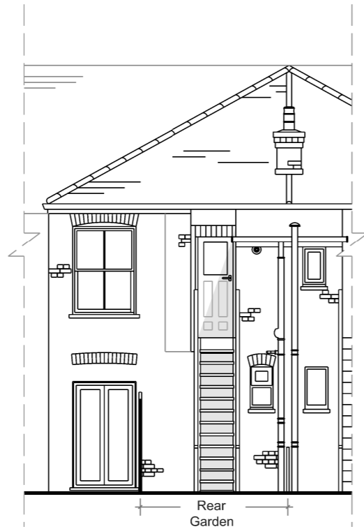
02 EXISTING REAR ELEVATION SCALE 1:100@A3