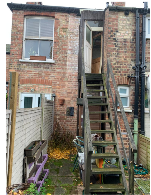
05 EXISTING SITE PHOTO NOT TO SCALE

Disclaimer This drawing has been prepared solely for assistance in the preparation of details for planning only. It is important to note that this material is not intended to be used for construction purposes. The information contained herein serves as a reference and guide to understand the intended design concept. We expressly disclaim any responsibility or liability for any damages, losses, or errors resulting from the use or reliance upon this material for actual construction. Any unauthorized use, reproduction, or dissemination of this documentation, in part or in whole, without our explicit written consent, is strictly prohibited. To be read in conjunction with all other relevant drawings and specifications. This drawing does not indicate or imply the structural condition of the existing property. All levels and dimensions are to be checked on site and any discrepancies are to be brought to the immediate attention of the Architect/CA. Do not scale off this drawing. Structural Design and Building Control approval is required before construction commences. All workmanship and materials to be installed and carried out in accordance with the latest and relevant British Standards as a minimum acceptable standard. This drawing is copyright and should not be reproduced in any way or form without prior consent from the Architect.