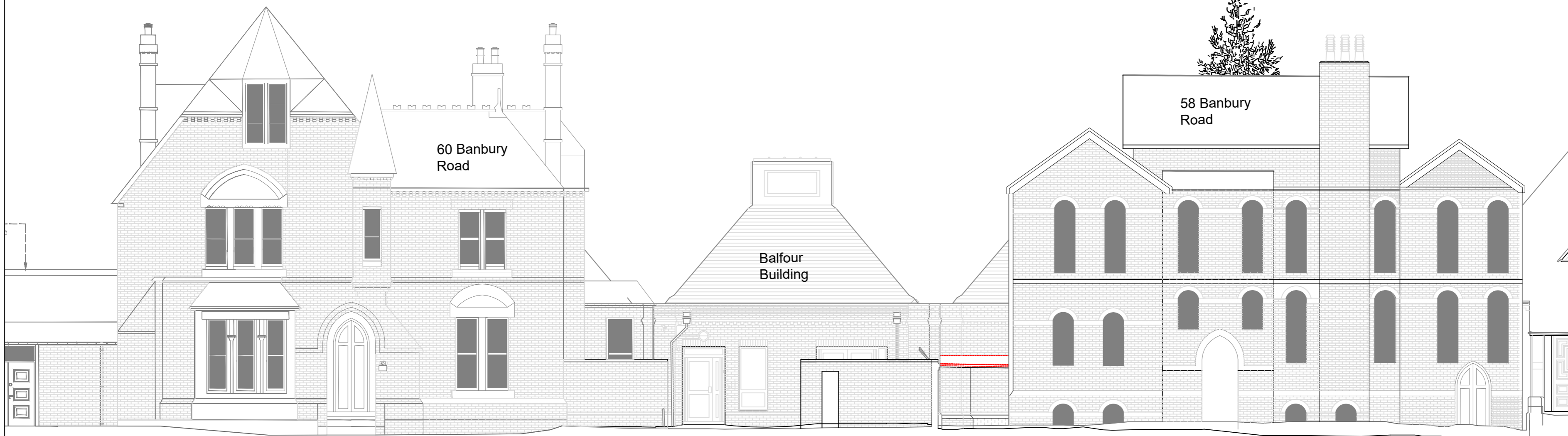
10 Existing Street Elevation 1:100