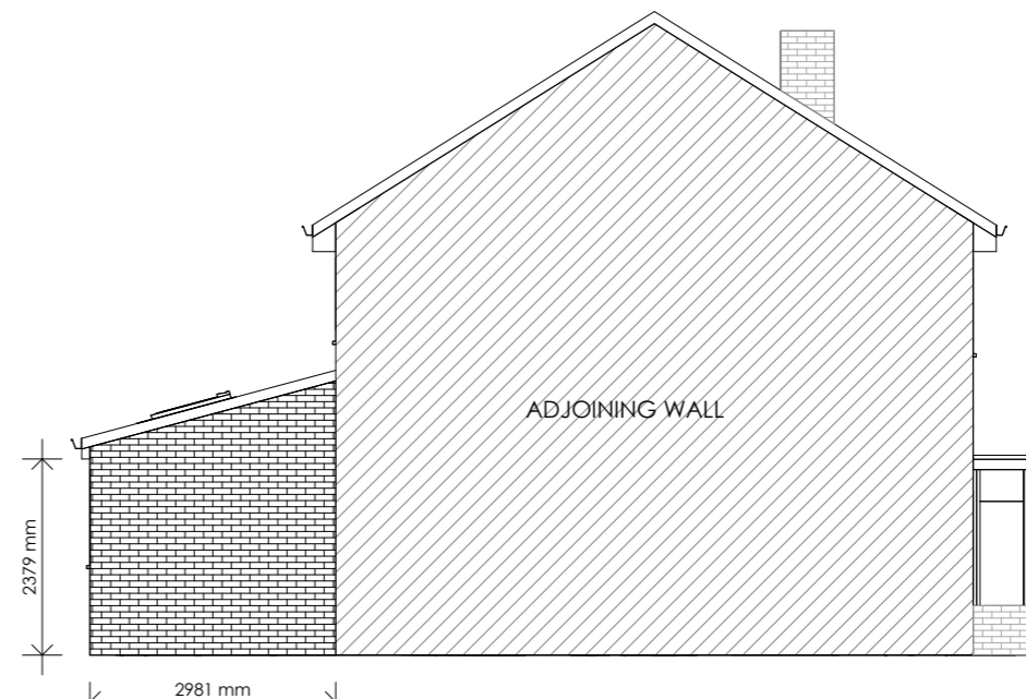
EXISTING SIDE B ELEVATION