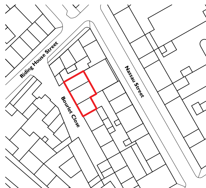
I SITE LOCATION PLAN 0001 1:1250 @ A3