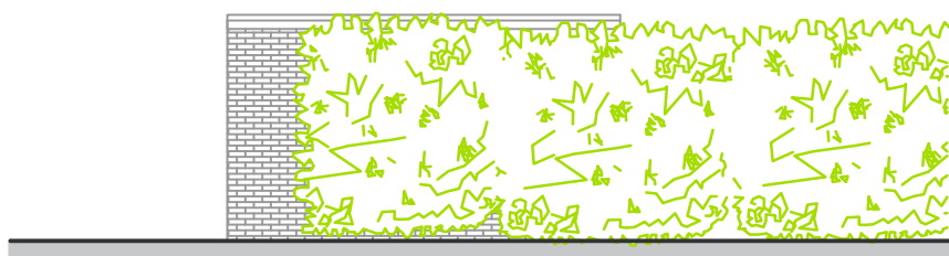
Proposed South Elevation Scale 1:100