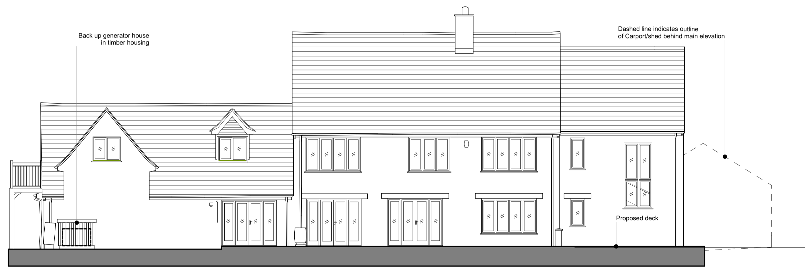
Datum 160.000m Rear Elevation