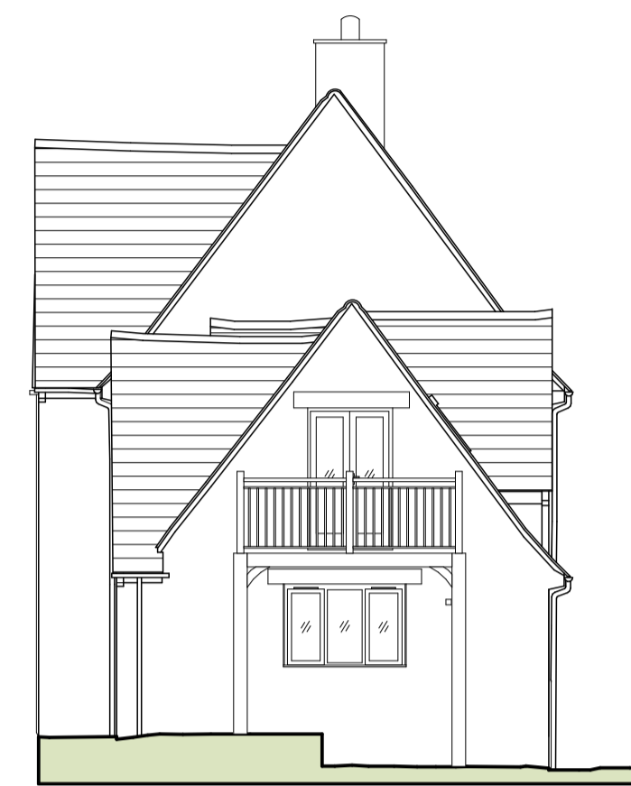
Datum 160.000m Side Elevation