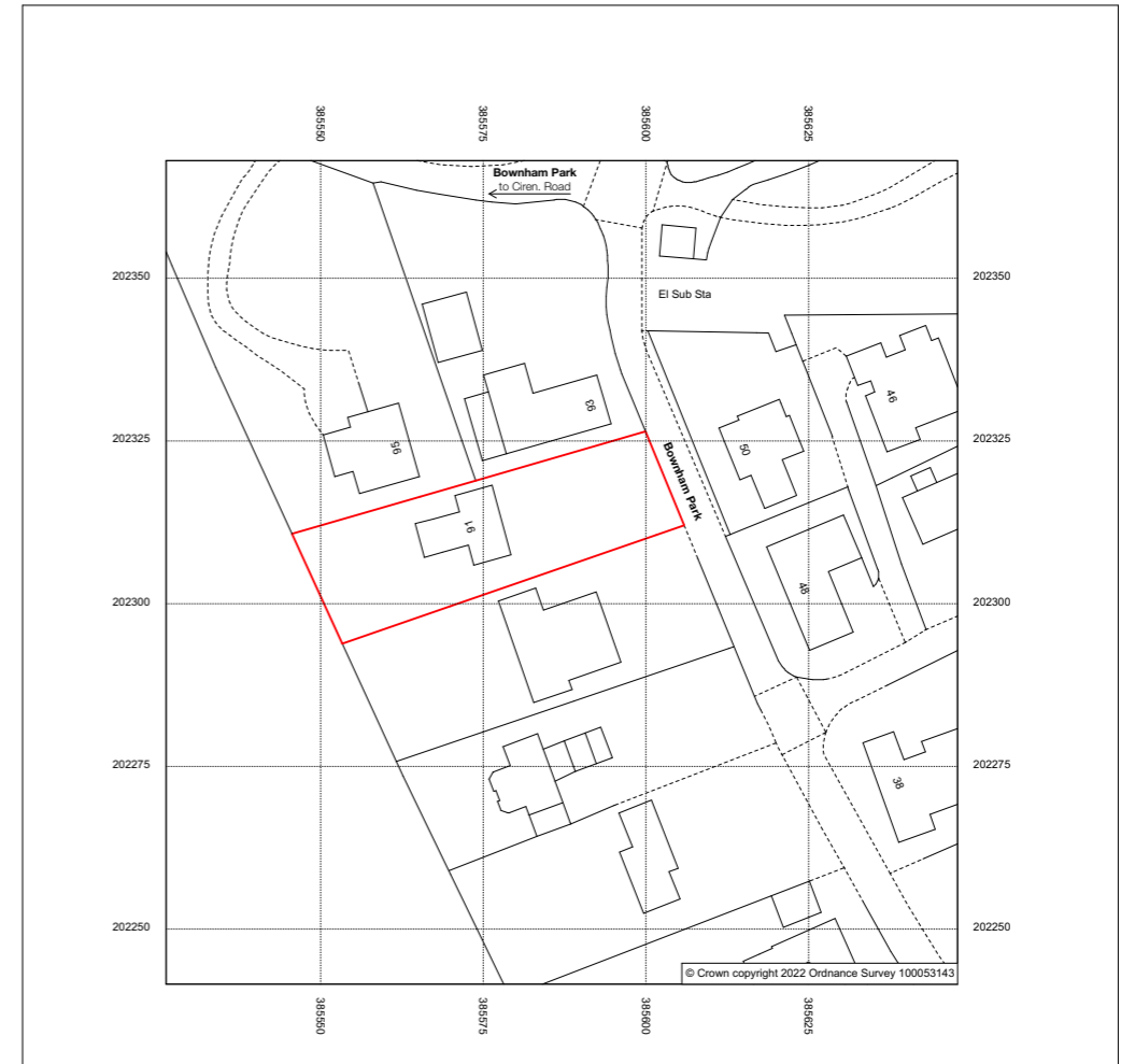
Site Location Plan Scale: 1:1250