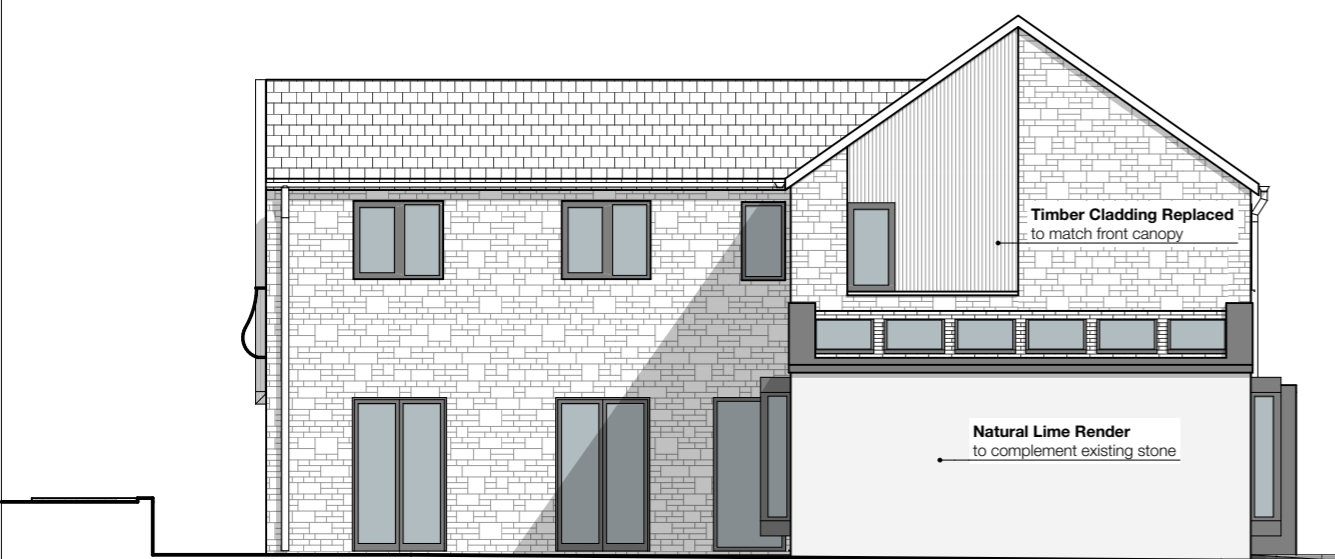
E.03 Proposed Side Elevation (South) Scale: 1:100