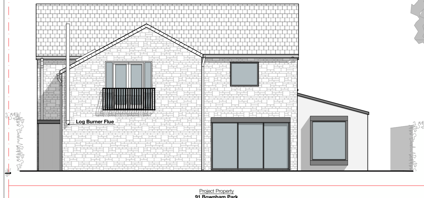
E.02 Proposed Rear Elevation (West) Scale: 1:100