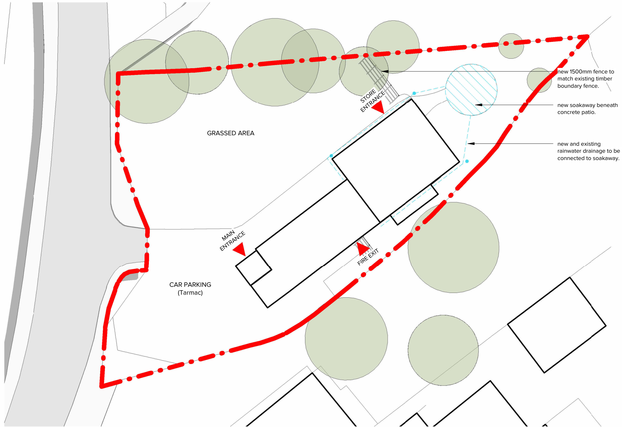
Proposed Block Plan SCALE - 1 : 250