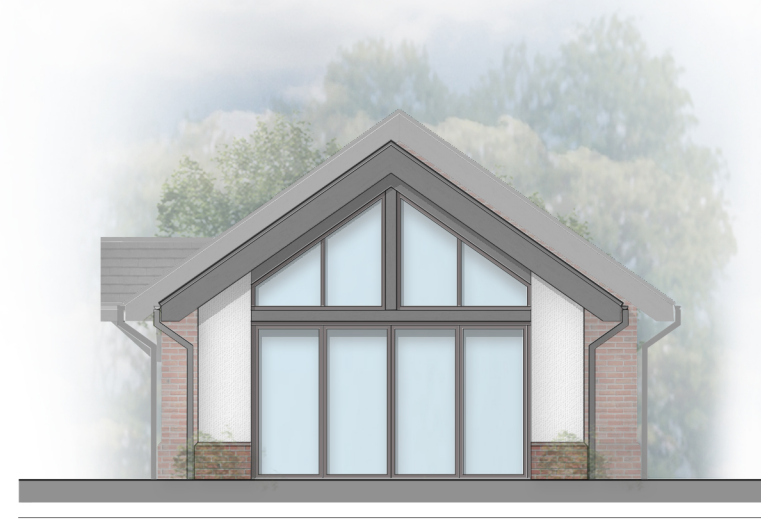
Rear Elevation South