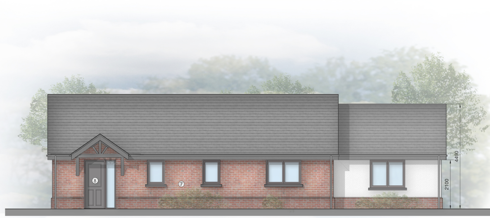
Side Elevation West