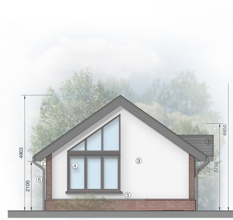
Front Elevation North