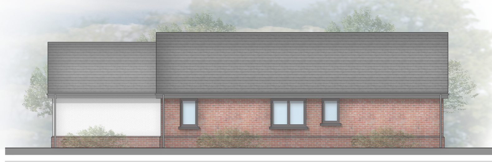
Side Elevation East