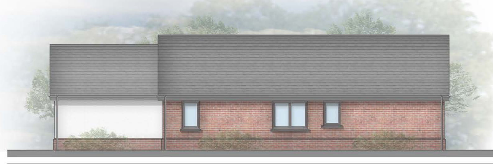
Side Elevation East