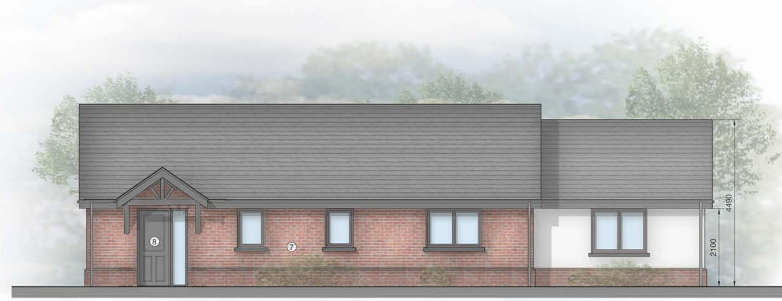
Side Elevation West