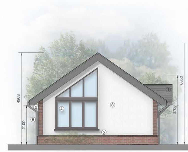
Front Elevation North