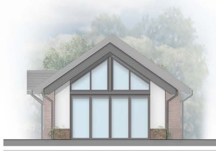
Rear Elevation South