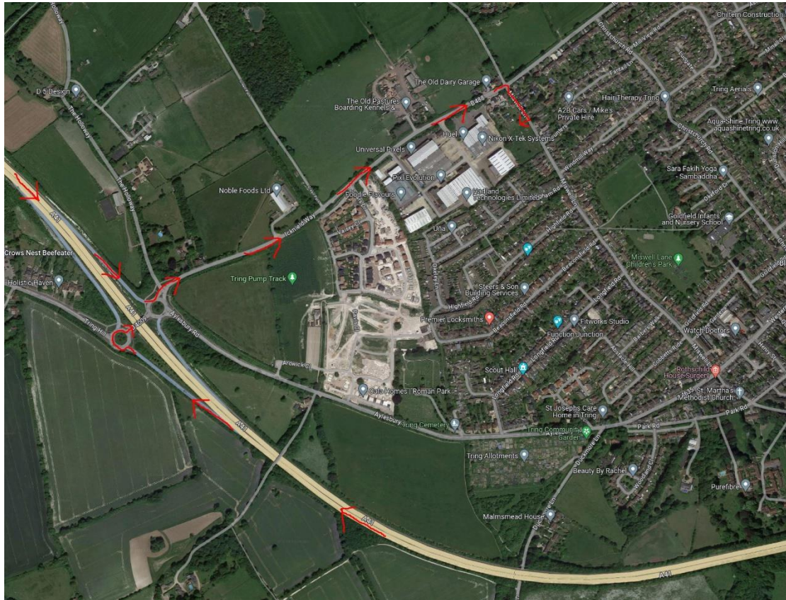
Table 1 – Daily delivery movements during construction

A larger version of the route is shown in Appendix A