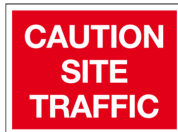
PICTURE: VEHICLE SIGNAGE