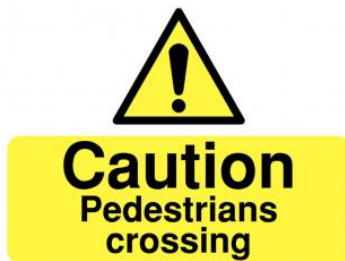
PICTURE: PEDESTRIAN SAFETY SIGNAGE

Signage will be placed within site boundaries making all vehicles aware of the pedestrian route. Signage will be placed at entrance and alerting pedestrians to construction vehicles.