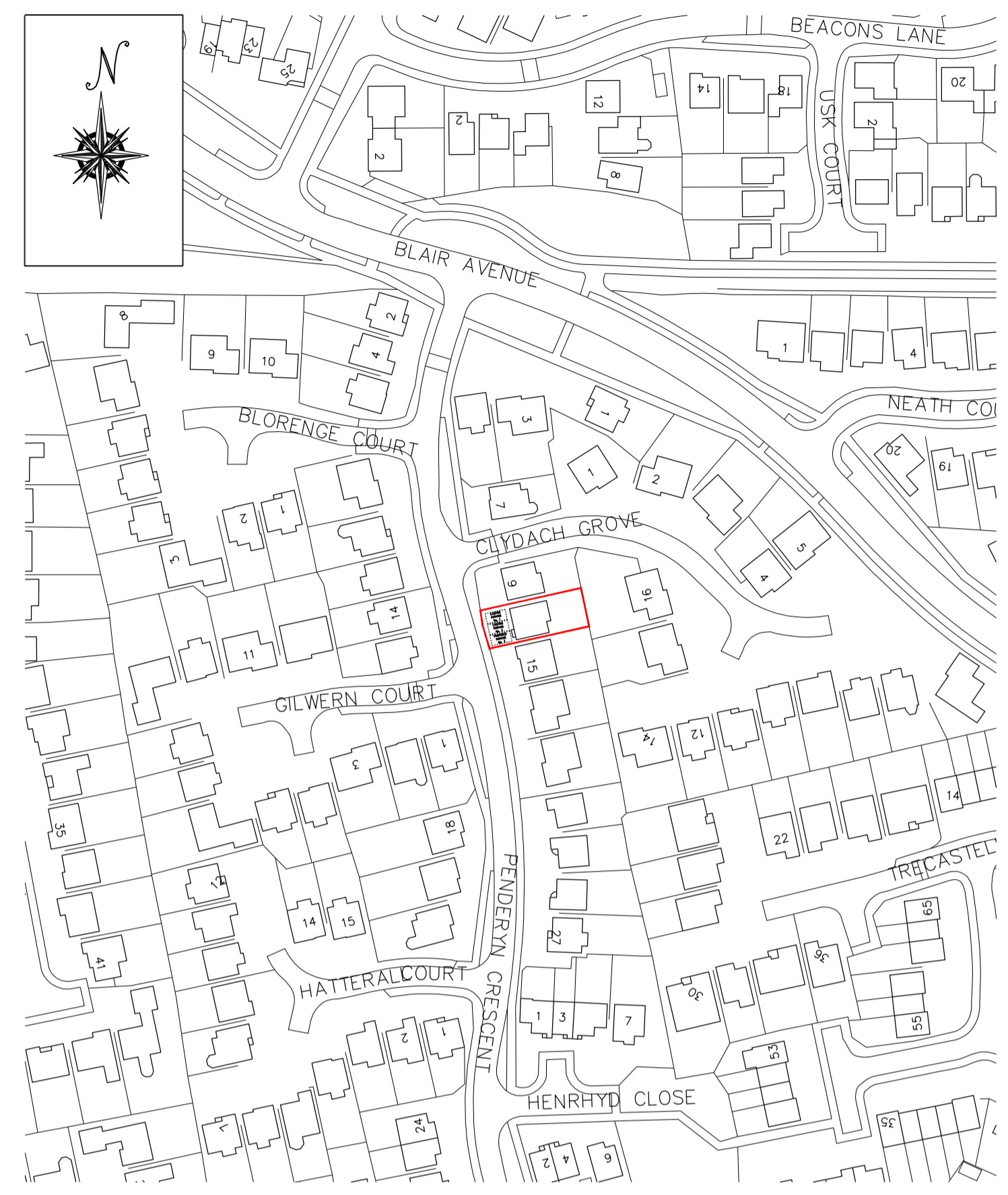
EXISTING LOCATION PLAN SCALE 1:1250