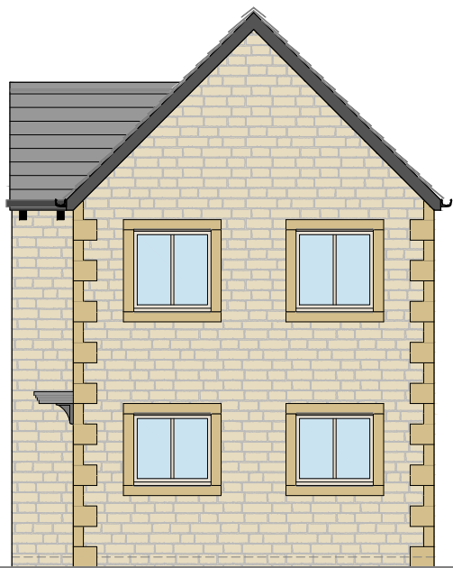
Front / Side Elevation