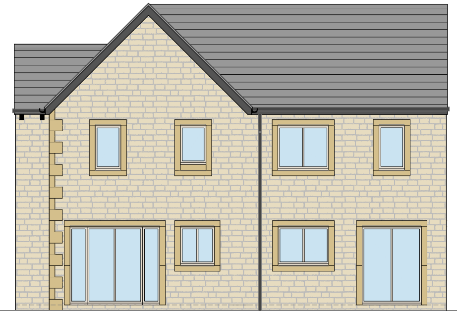
Rear Elevation Plot 5a