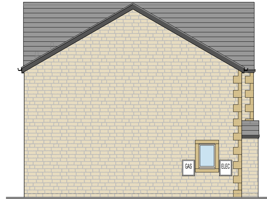
Side Elevation Plot 4a