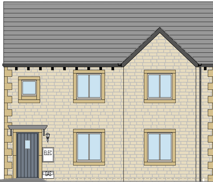
Front Elevation Plot 5a