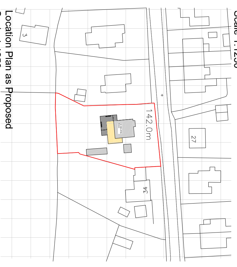
Location Plan as Proposed Scale 1:1250