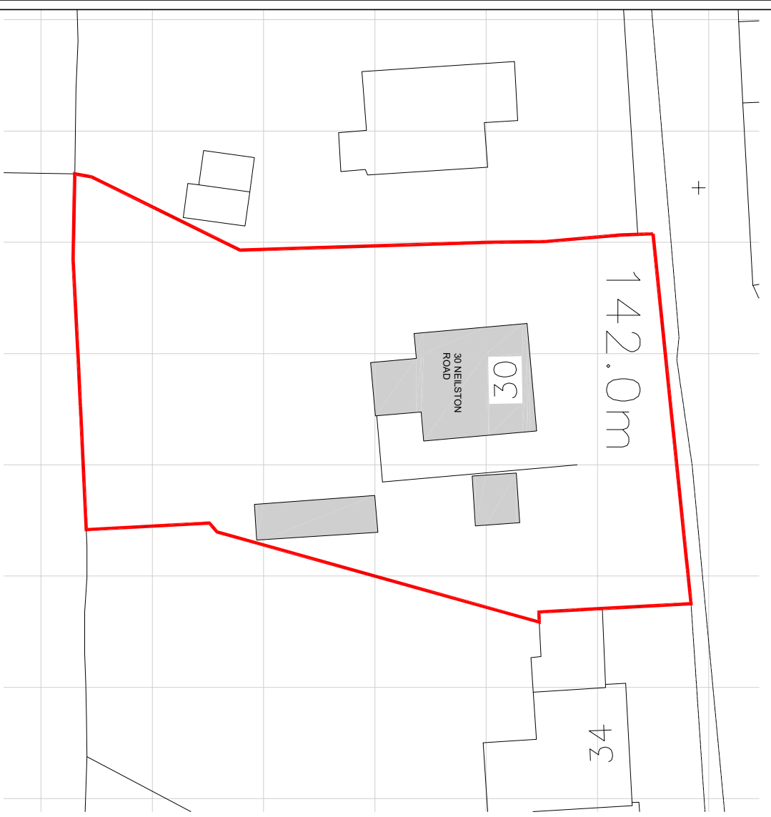
Block Plan as Existing Scale 1: 500

This drawing is the property of CAFO Designs. Copyright is reserved by them and the drawing is issued on the condition that it is not copied, reproduced, retained or disclosed to any unauthorised person, either wholly or in part without the consent in writing of CAFO Designs N.B: any variations between stated dimensions and site dimensions should be reported to the surveyor prior to work being executed.