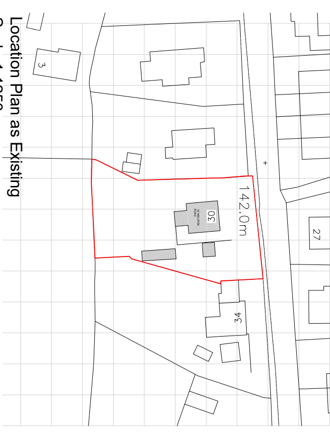
Location Plan as Existing Scale 1:1250