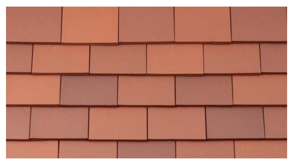
Roof small planes ie: porches on plots 1 & 2, family room projection plot 3 - Natural red plain tiles