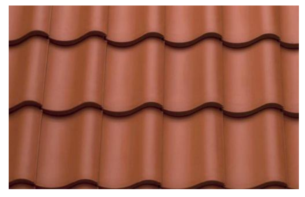
Roof main planes – natural red clay pantiles