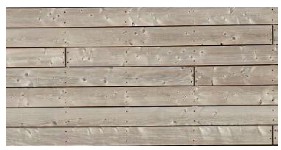
Cladding - Weathered larch or cedar

External joinery – colour coated flush casements