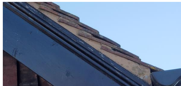
6 Gaps under tiles at rake