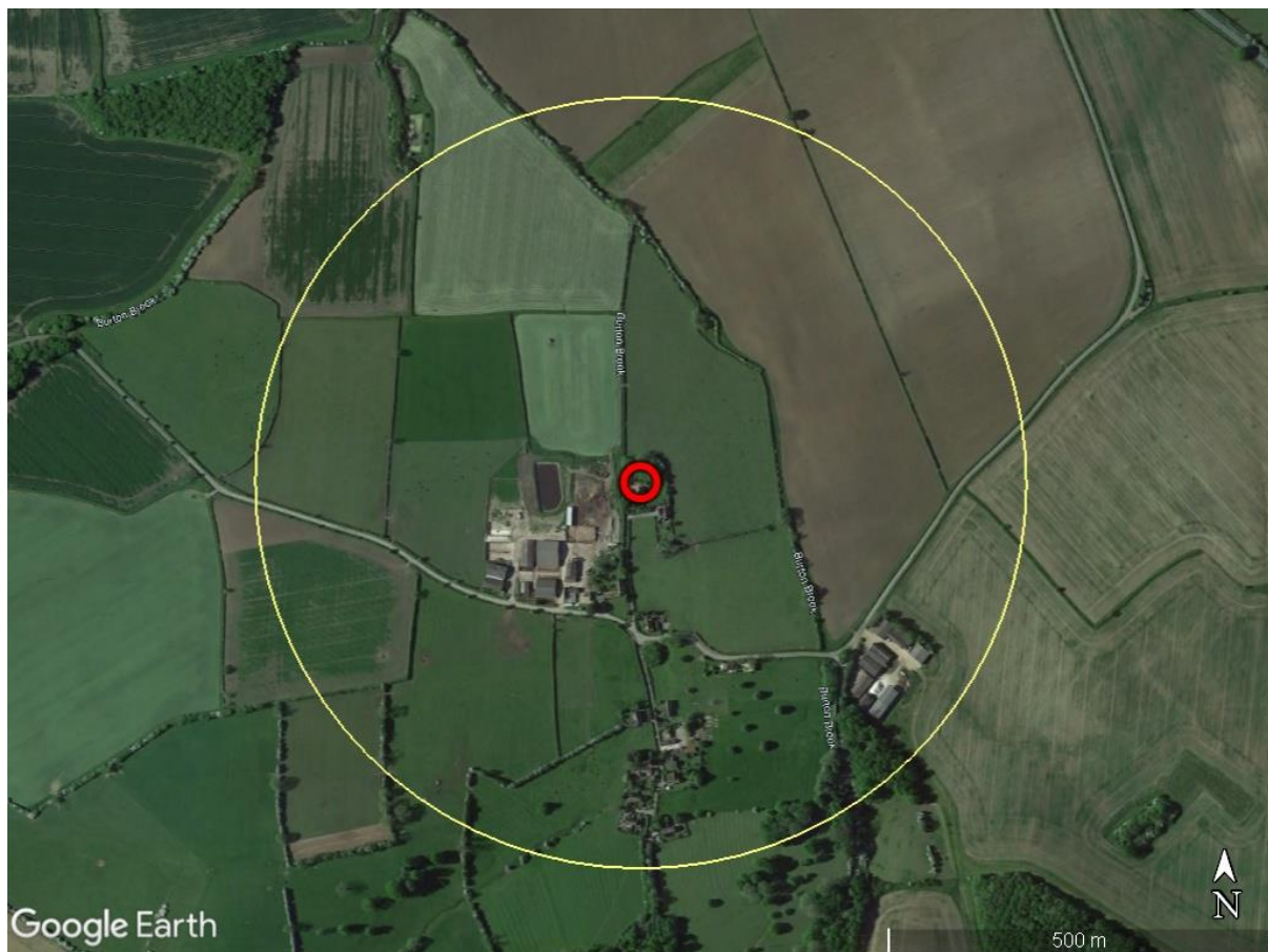
Figure 1 – Site Location

The habitats in the area are suitable for foraging and commuting bats.