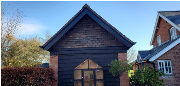
3 West aspect