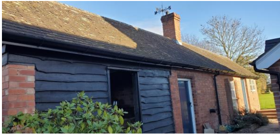
1 South aspect