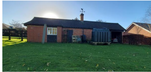
2 North aspect