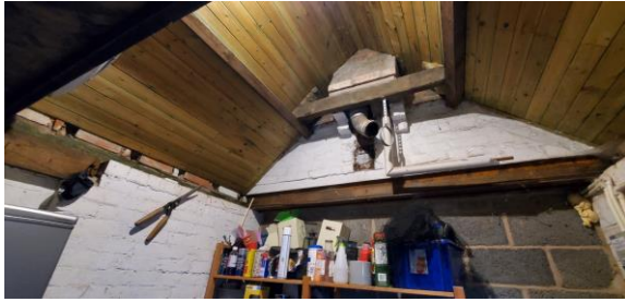
11 Internal view of middle room