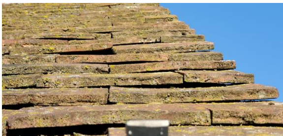
5 Natural gaps under tiles