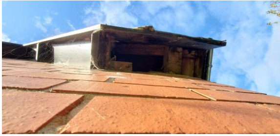
9 Gap under boxed soffit on east gable