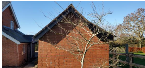
4 East aspect