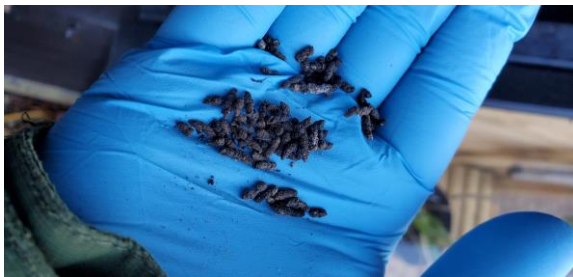
13 Bat droppings caught falling from hanging tile