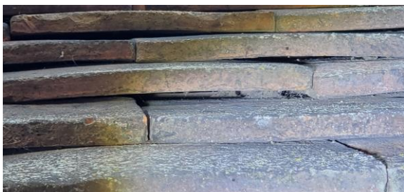
7 Natural gaps under hanging tiles