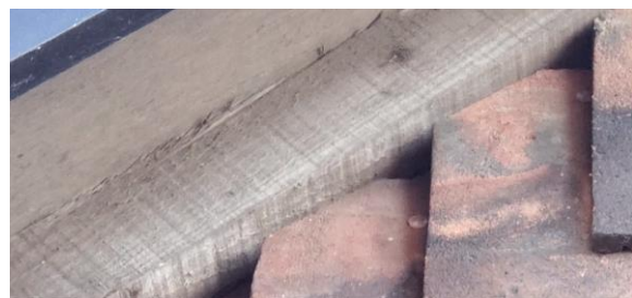
8 Gaps above hanging tiles