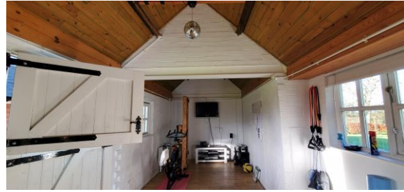
12 Internal view of eastern room