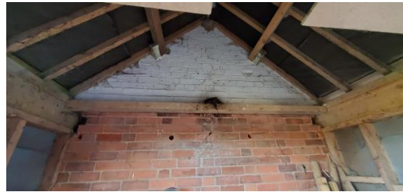
10 Internal view of open store – note barn swallow nests