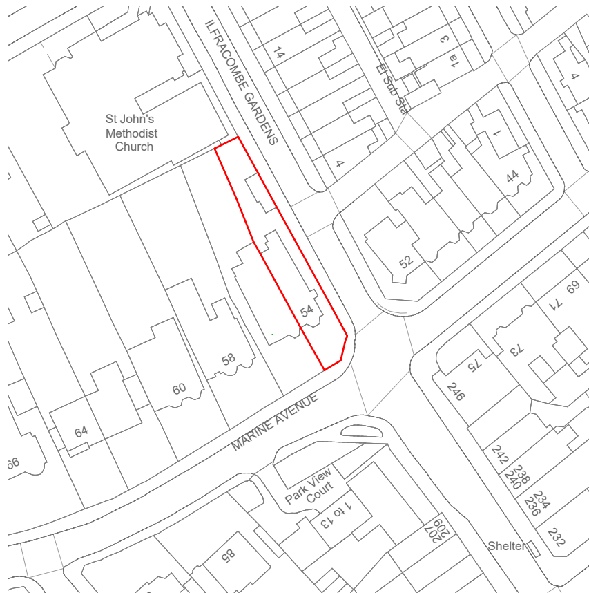
54 Marine Avenue, Whitley Bay, NE26 1NQ Location Plan: 2Ha @ scale 1:1250 on A4 sheet.