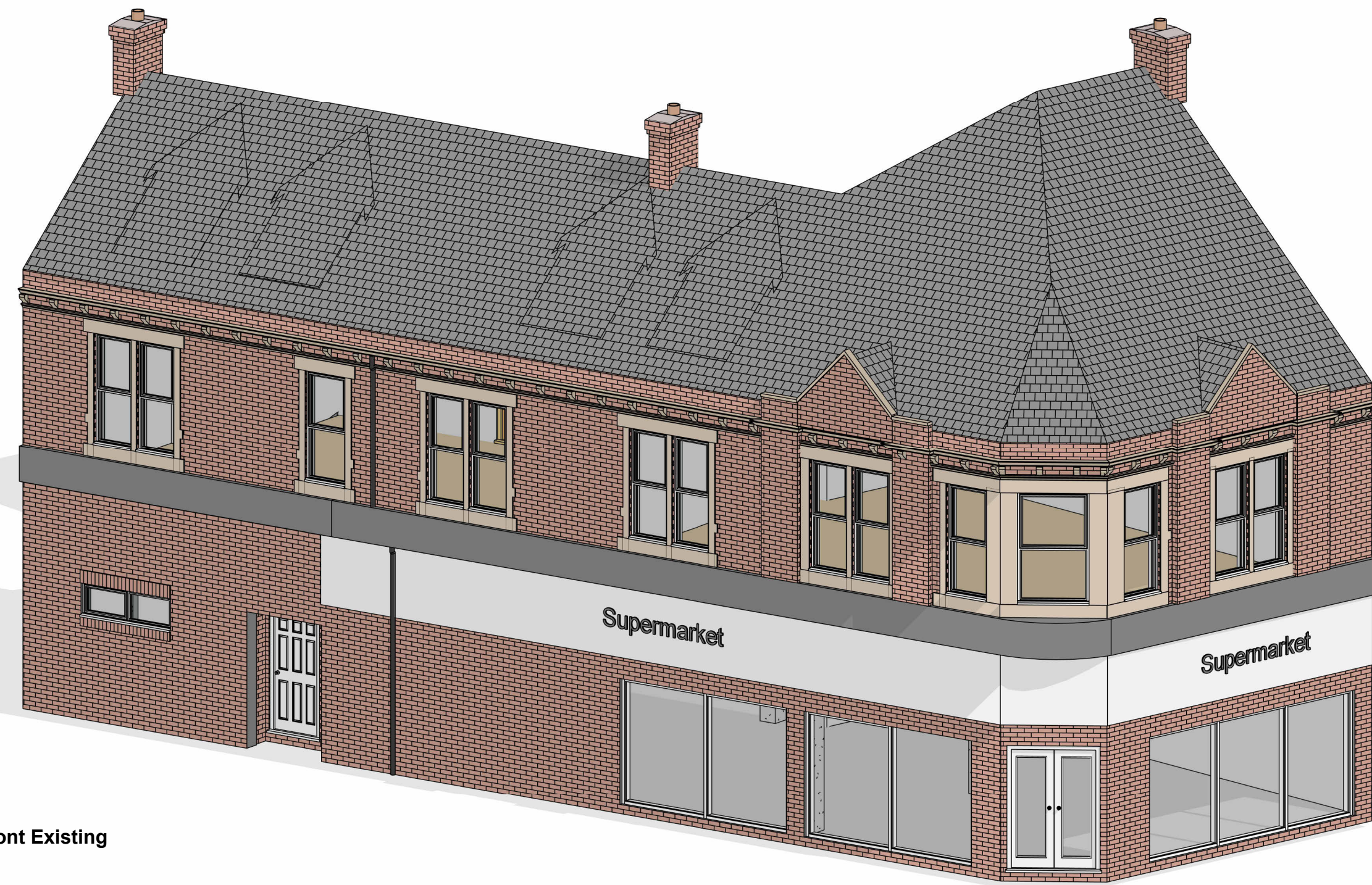
3D Front Existing