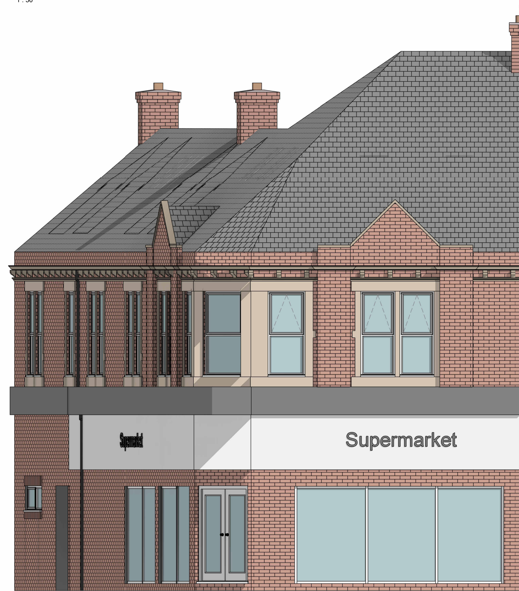
Existing South Existing 1:50