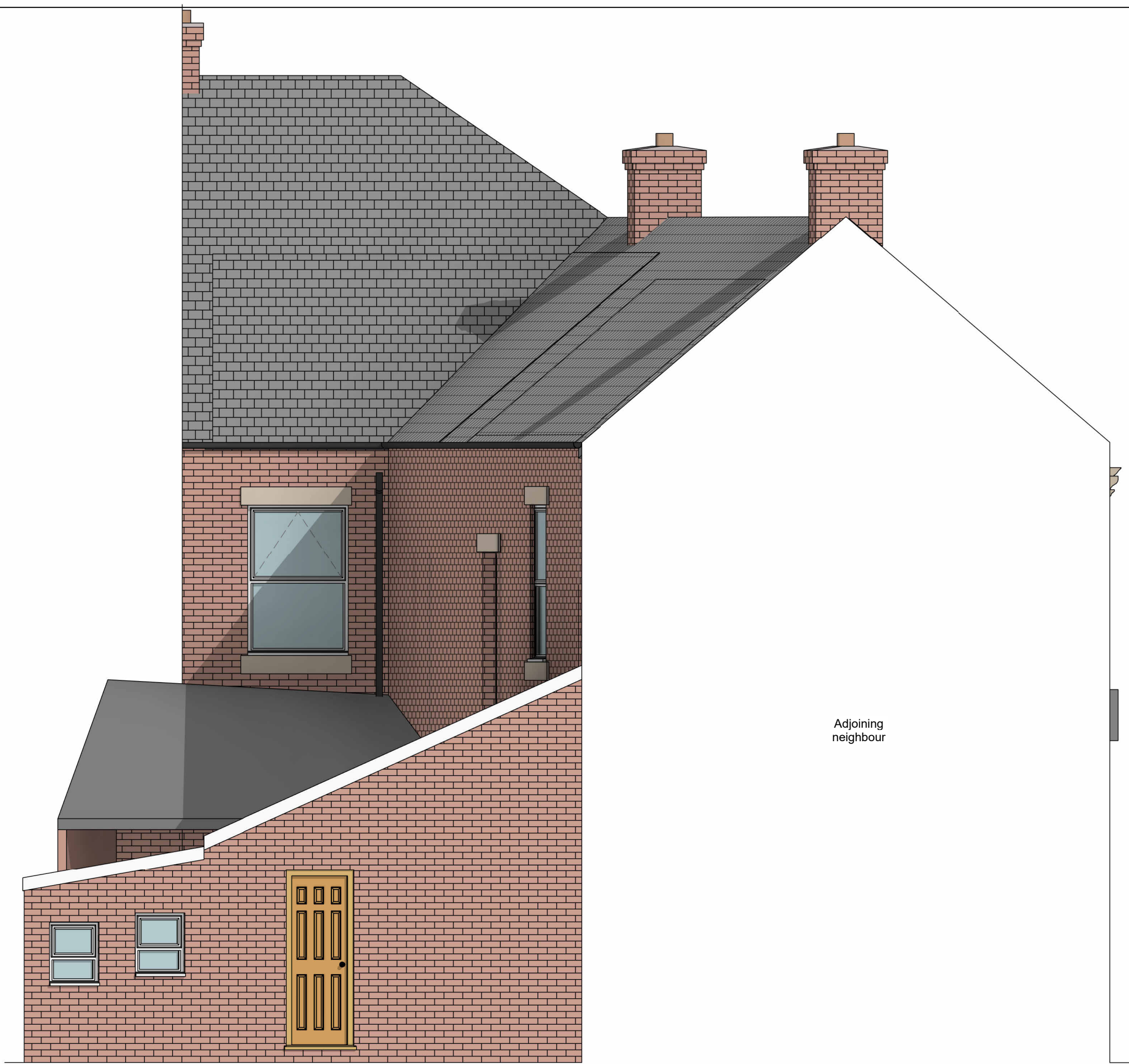
Existing North Existing 1:50