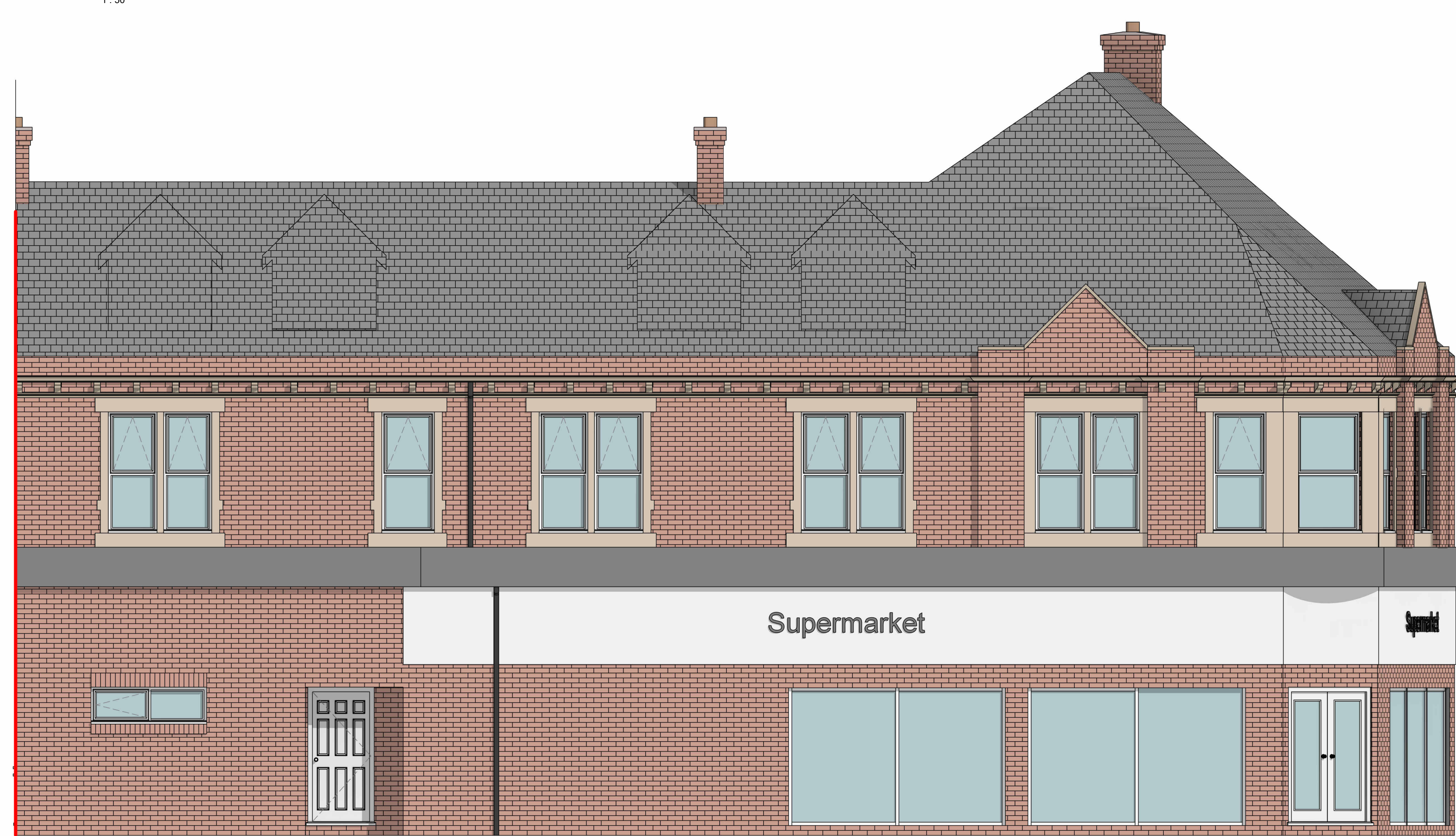
Existing West Elevation 1:50