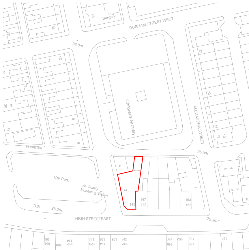
2 Ferndale Ave, Wallsend NE28 7NA Location Plan: 2Ha @ scale 1:1250 on A4 sheet.