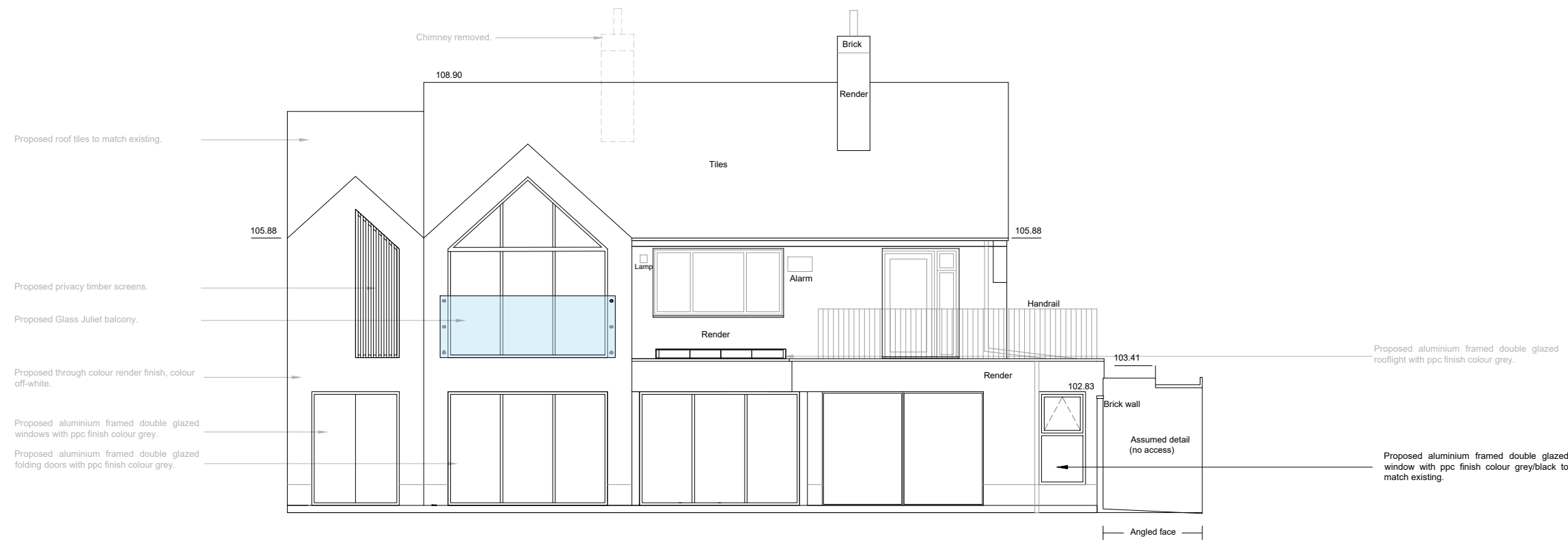
Datum 99.00m AOD South Western Elevation