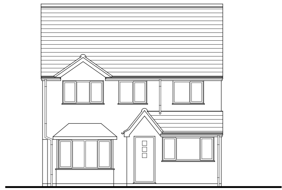
FRONT ELEVATION WEST