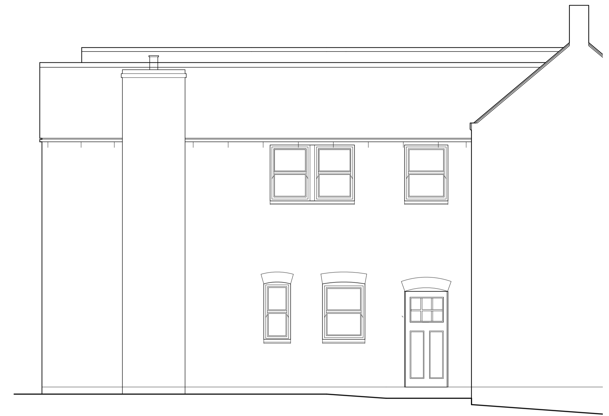
EXISTING SOUTH EAST ELEVATION