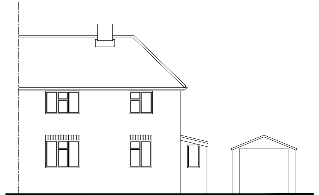
AS EXISTING FRONT ELEVATION 1:100 @ A3