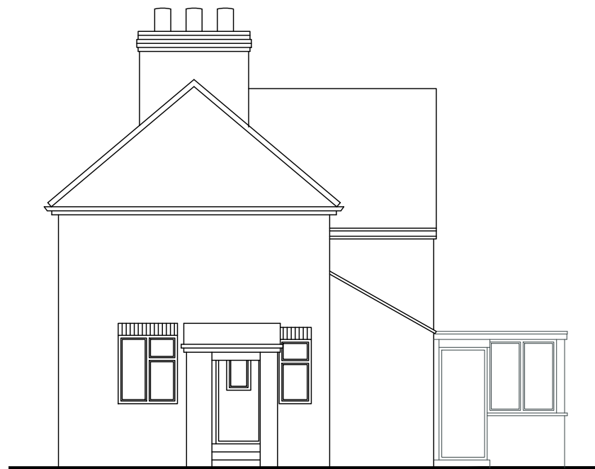
AS EXISTING SIDE ELEVATION 1:100 @ A3