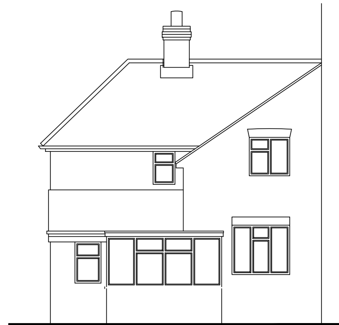
AS EXISTING REAR ELEVATION 1:100 @ A3