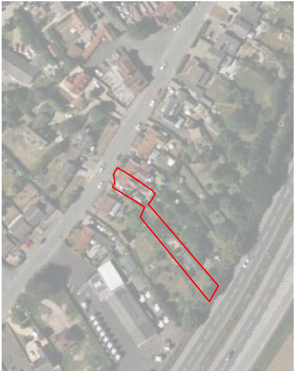
AERIAL PHOTO (NOT TO SCALE)