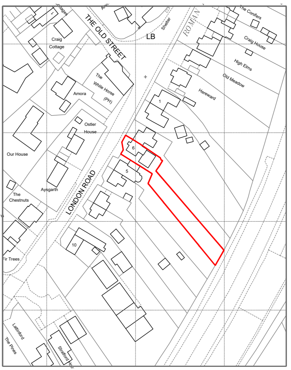
SITE LOCATION PLAN AS PROPOSED (1 :1250)