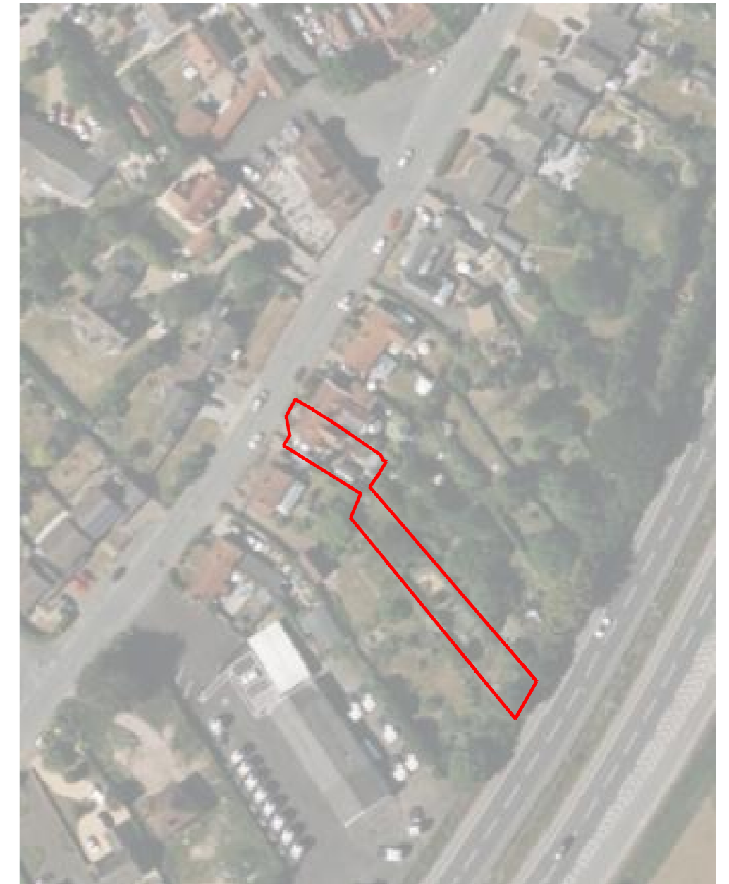
AERIAL PHOTO (NOT TO SCALE)