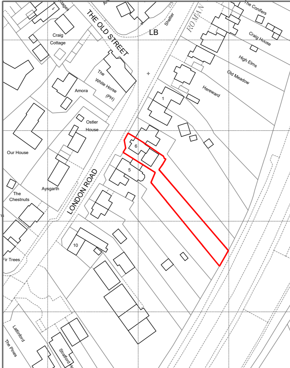
SITE LOCATION PLAN AS PROPOSED (1 :1250)