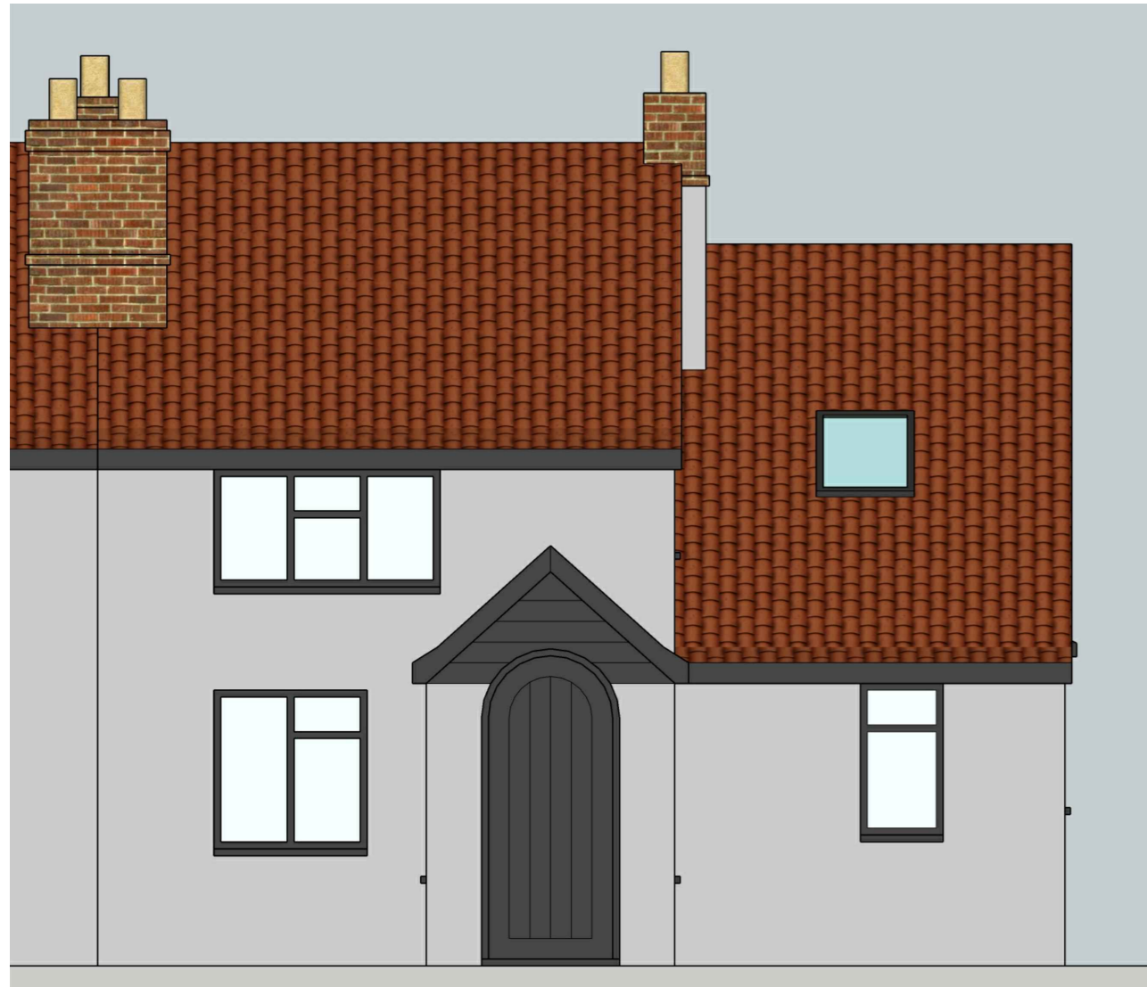
FRONT ELEVATION (1:50)