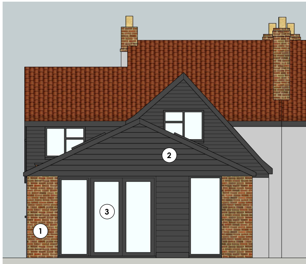
REAR ELEVATION (1:50)