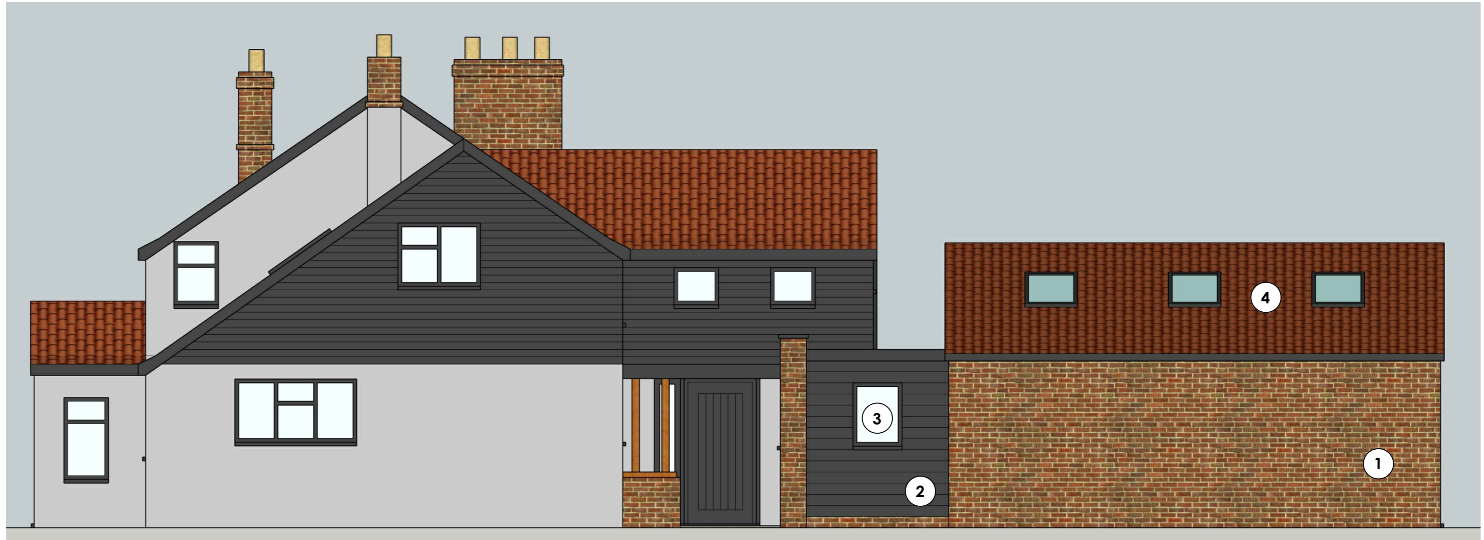
SIDE ELEVATION (1:50)