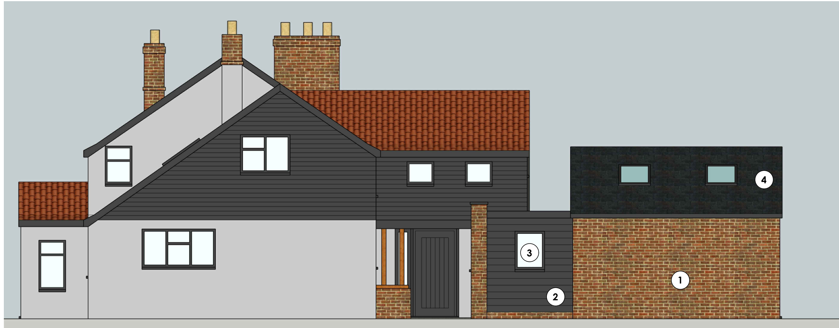
SIDE ELEVATION (1:50)