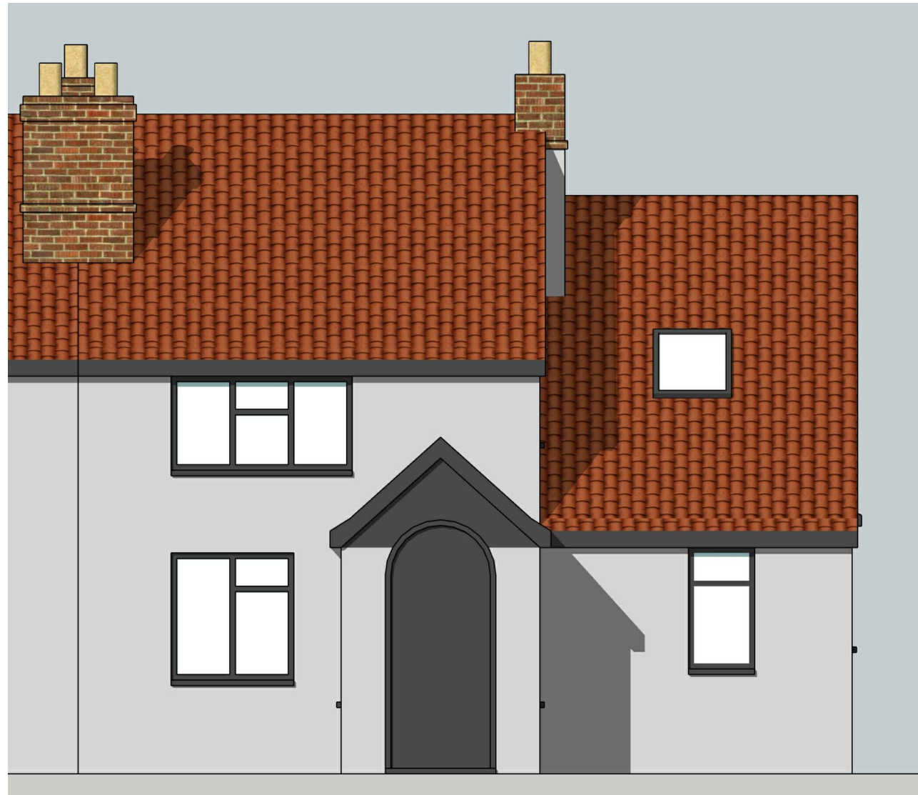
FRONT ELEVATION (1:50)