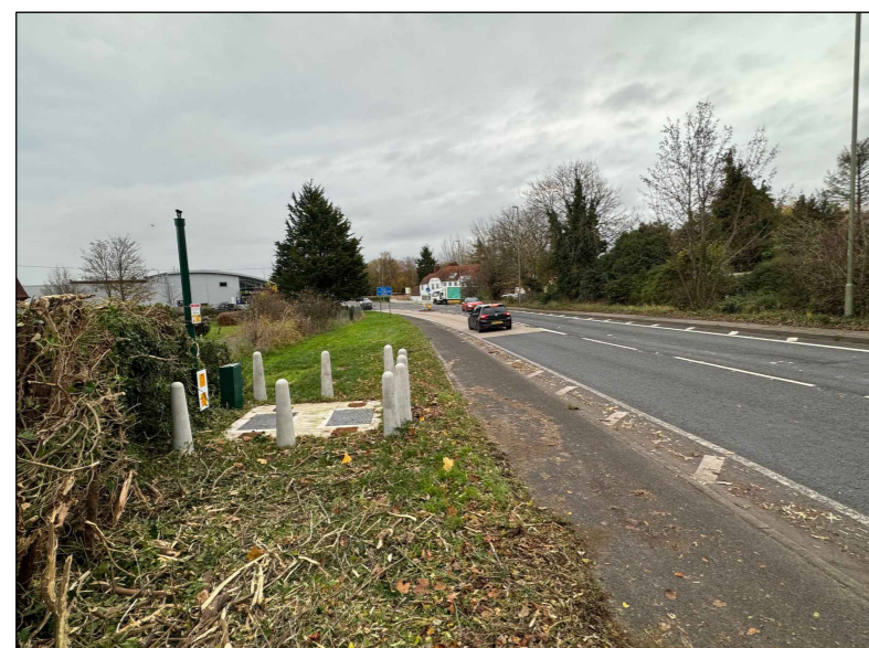
View from proposed crossover looking east.