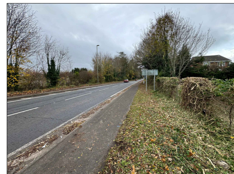
View from proposed crossover looking west.