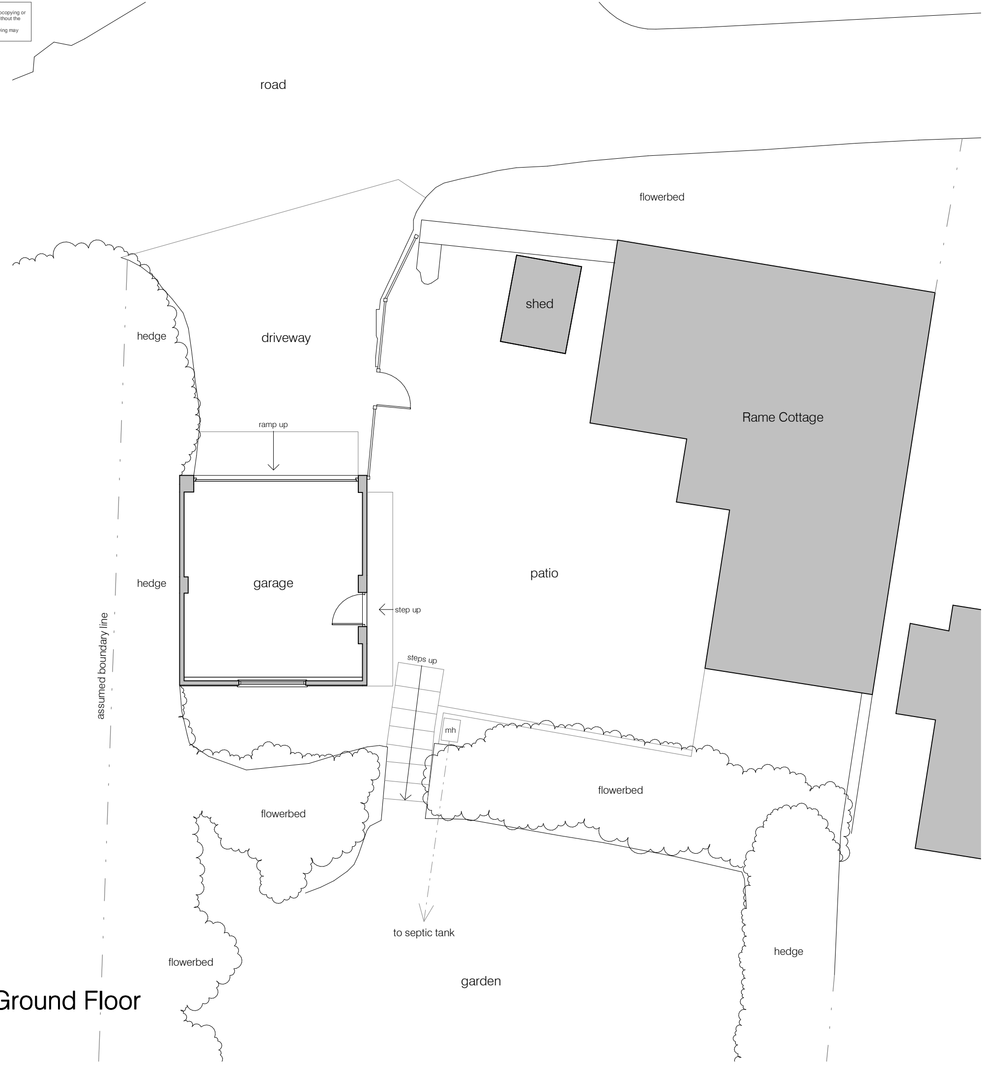
Existing Ground Floor 1 : 100