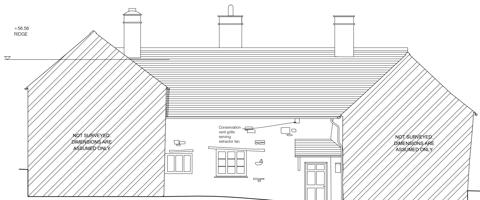
INTERNAL EAST ELEVATION PROPOSED 1/100

P2 20.11.23 EXTRACT MOVED TO INTERNAL COURTYARD