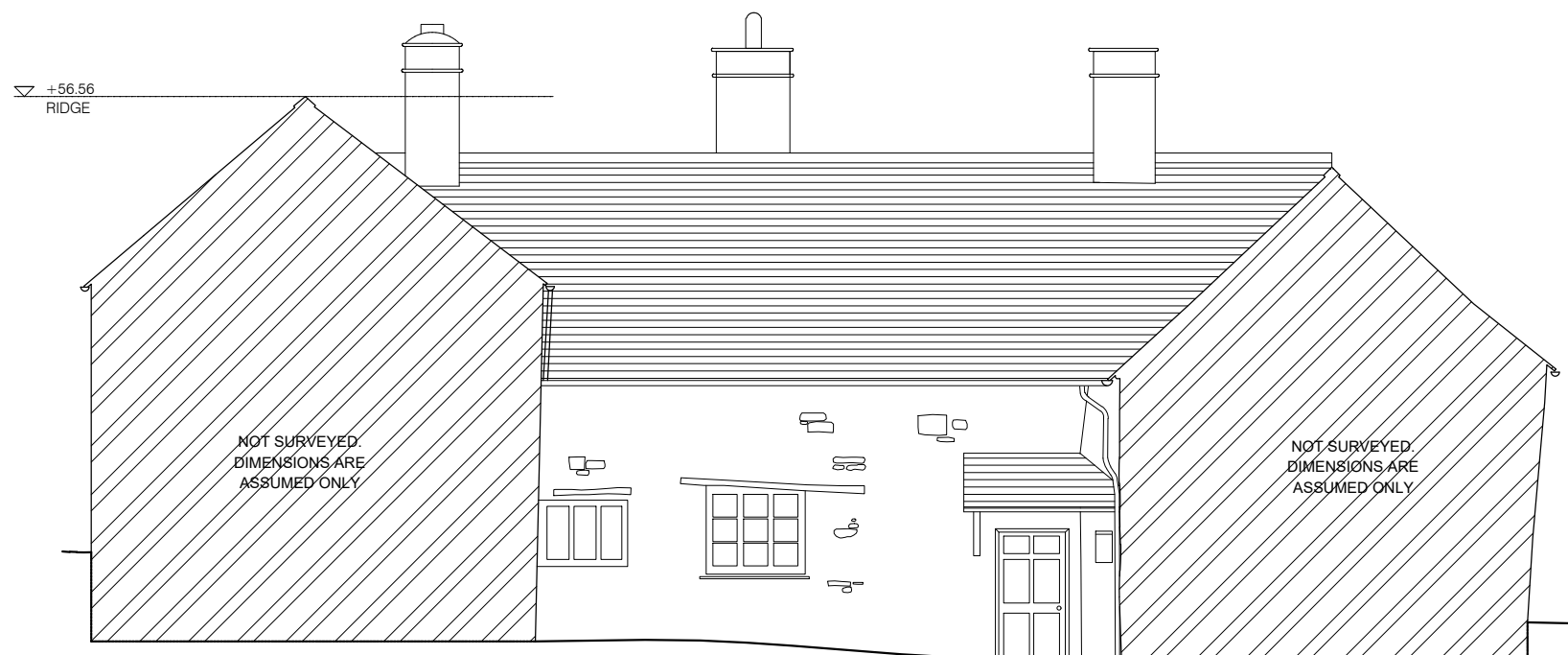
INTERNAL EAST ELEVATION EXISTING 1/100