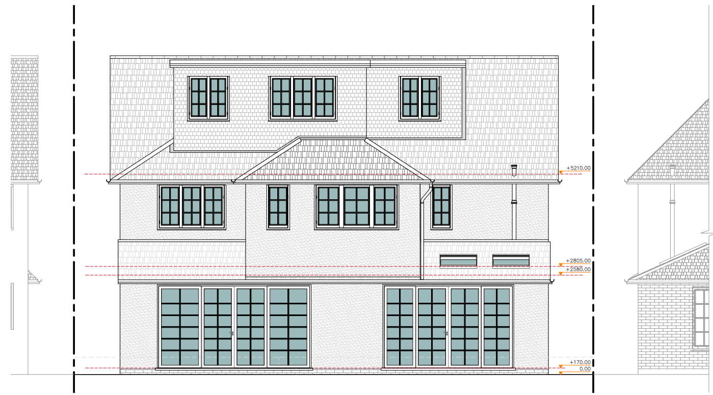
2 PROPOSED REAR ELEVATION 015 SCALE 1:100