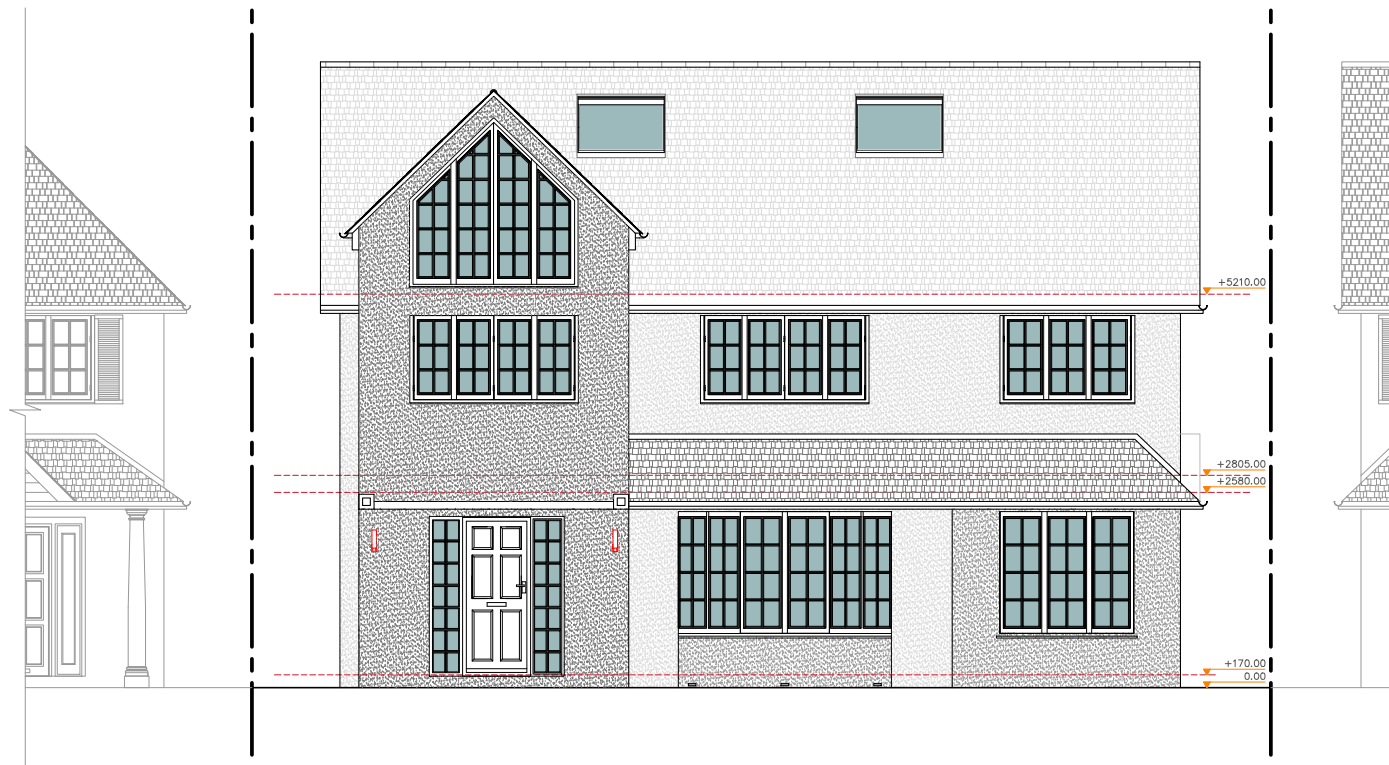
1 PROPOSED FRONT ELEVATION 015 SCALE 1:100