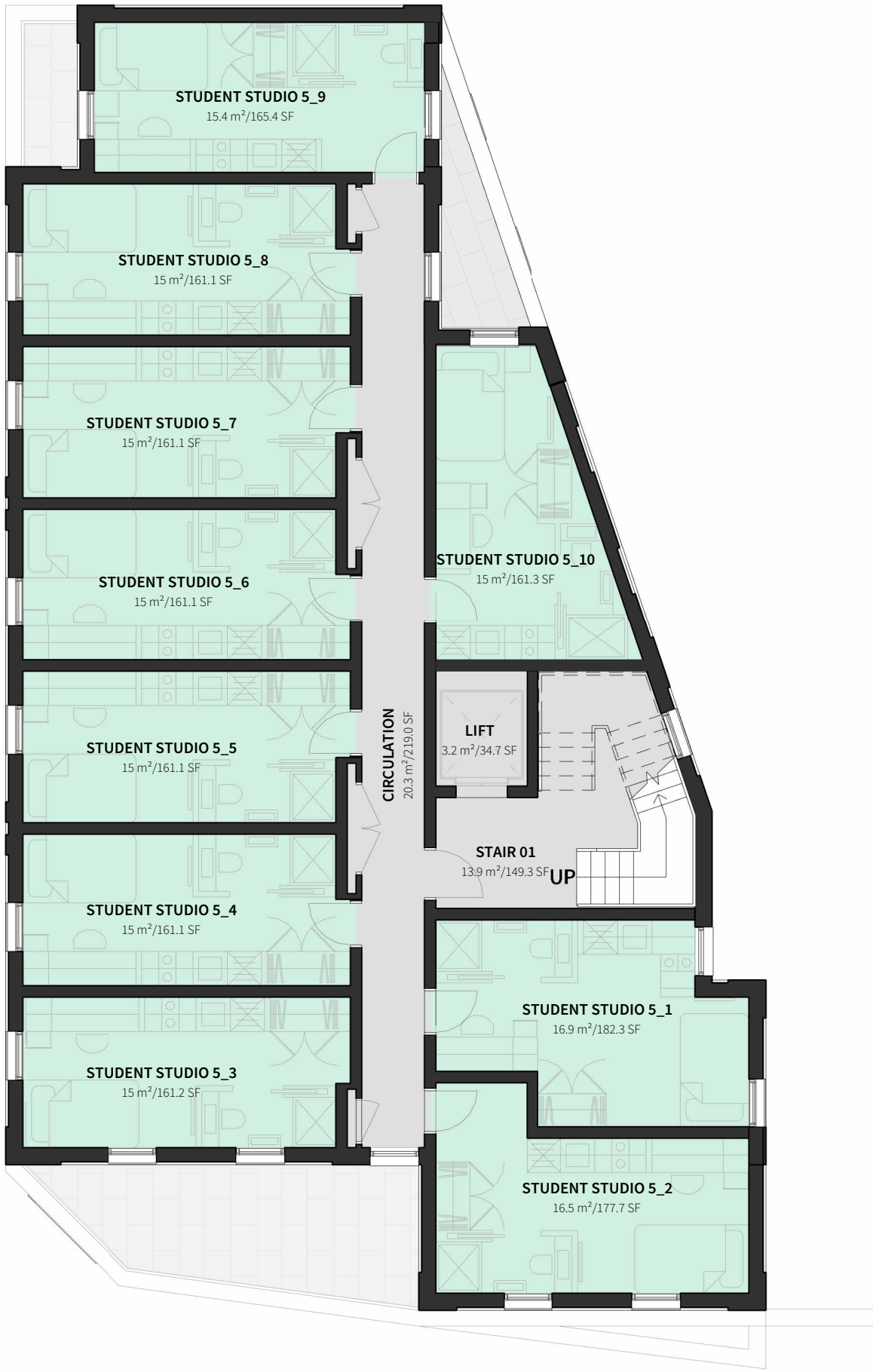
05 GA-Plan_05-Fifth 1 : 100