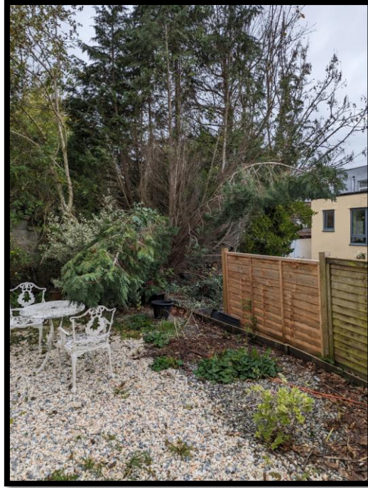
Figure 1 – T1 & T2 from rear garden of 2 Sydenham Road