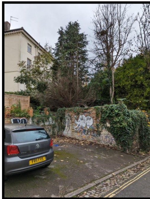
Figure 2 – T1 & T2, parking bay and retaining wall from Sydenham Lane