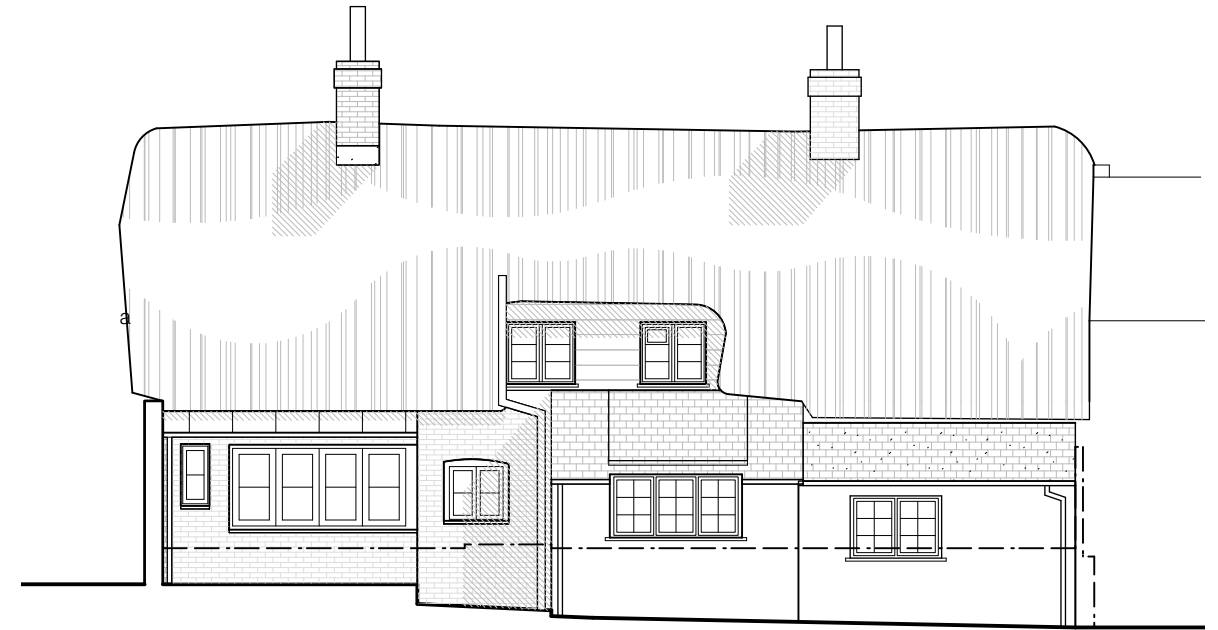
West Elevation 1:100 EXISTING