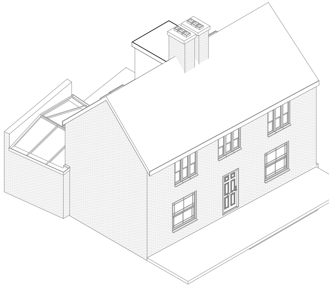
Existing 3D 1