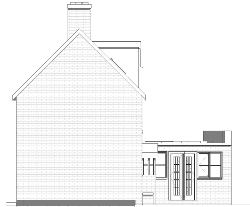
Proposed Elevation-Right side