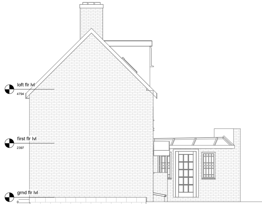
Existing Elevation-Right side