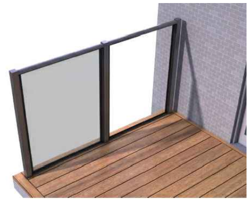
1.80 m OBSCURED GLAZED PRIVACY SCREEN