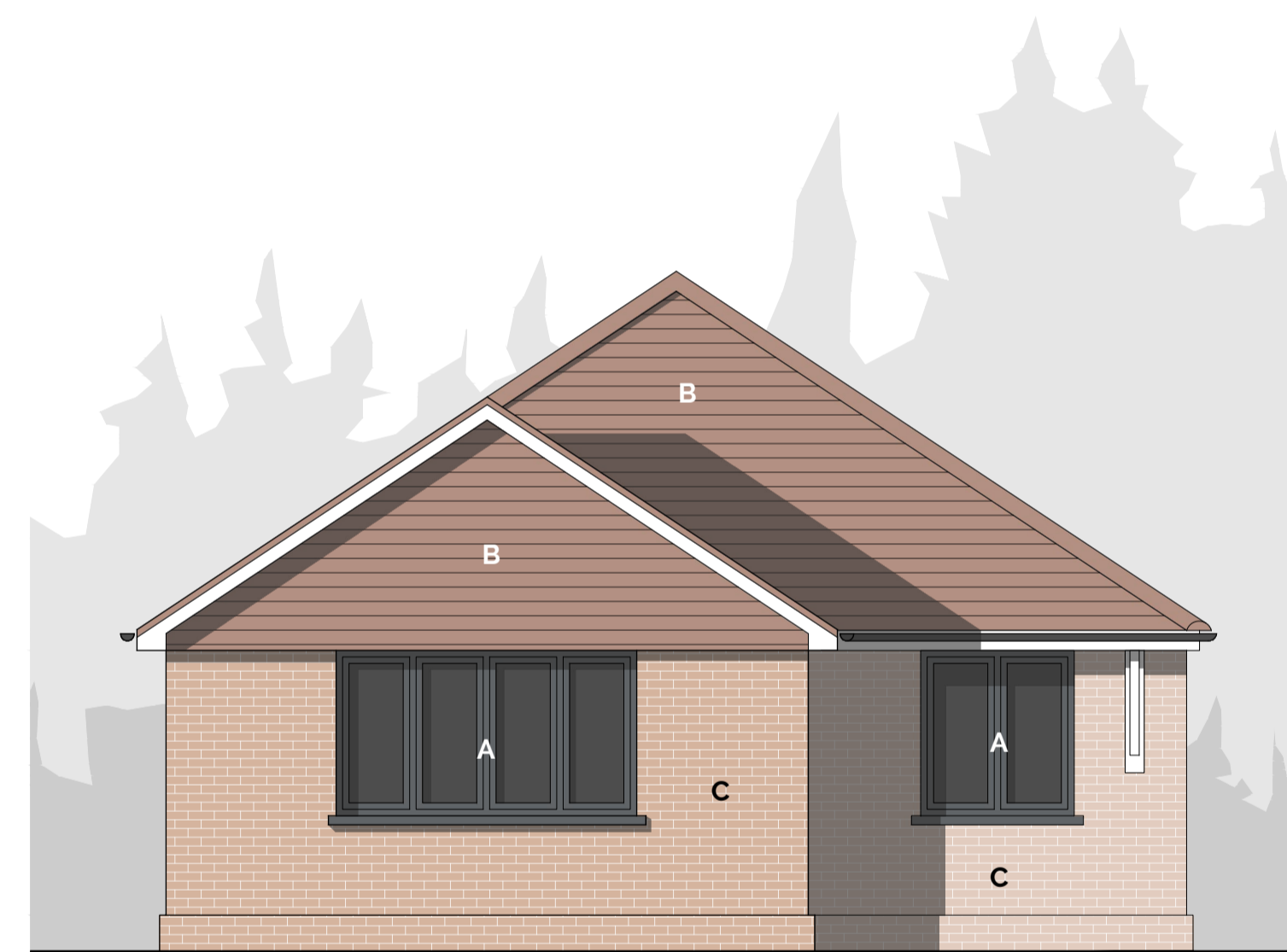
FRONT (NORTH EAST)