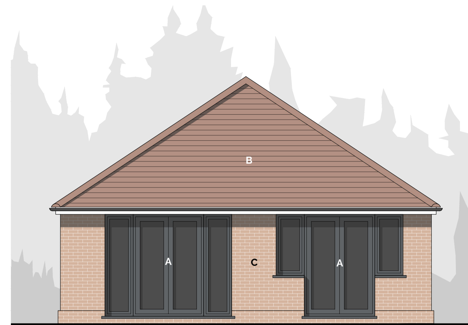
REAR (SOUTH WEST)