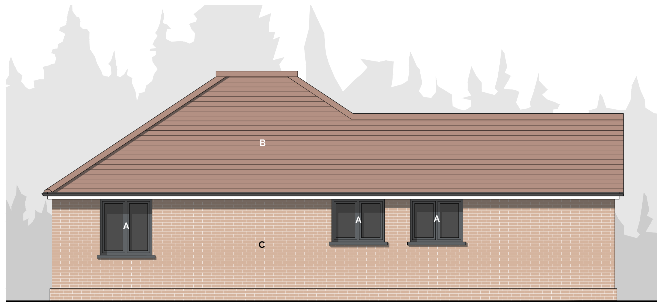
SIDE (SOUTH EAST)

DISCLAIMER This drawing is to be read in conjunction with all relevant supporting drawings, documents and information submitted alongside including any survey or specialist designs and comments. Any discrepancies are to be raised immediately. No assumptions are to be made unless otherwise noted.