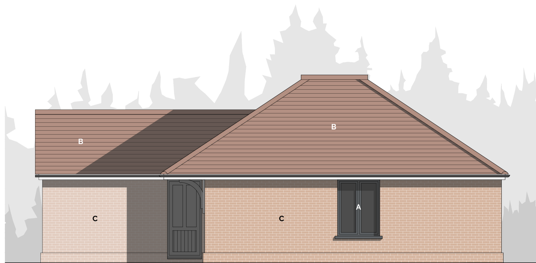
SIDE (NORTH WEST)