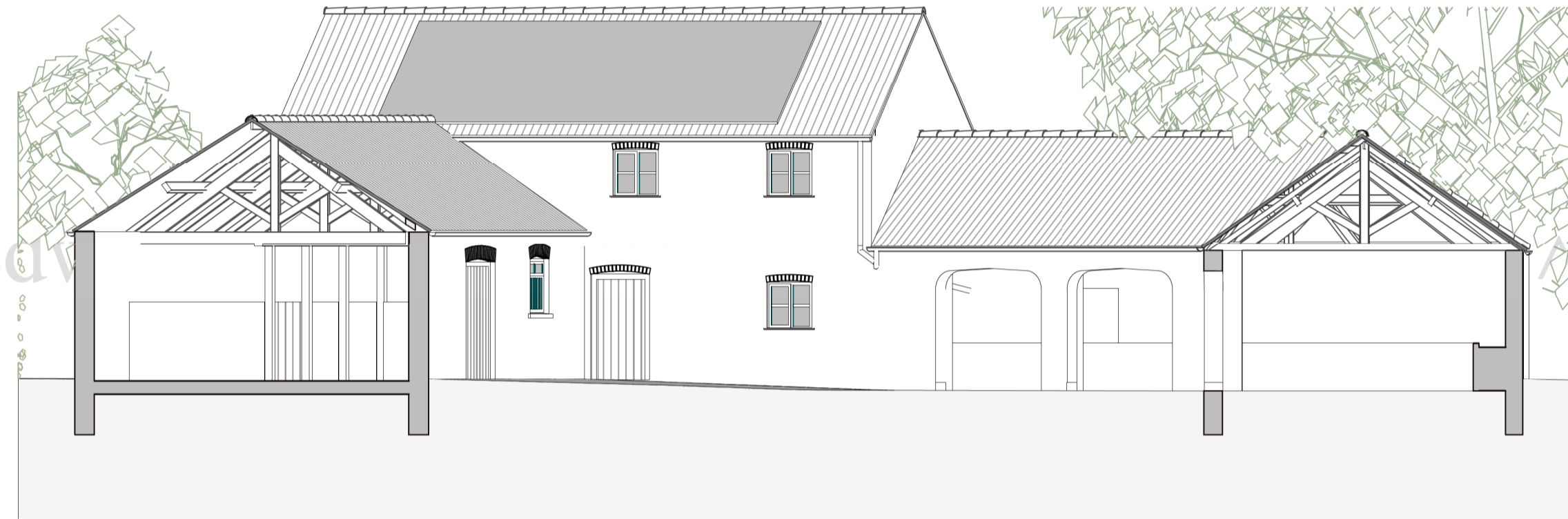
Yard Section I, South Elevation Yard 2 1:100