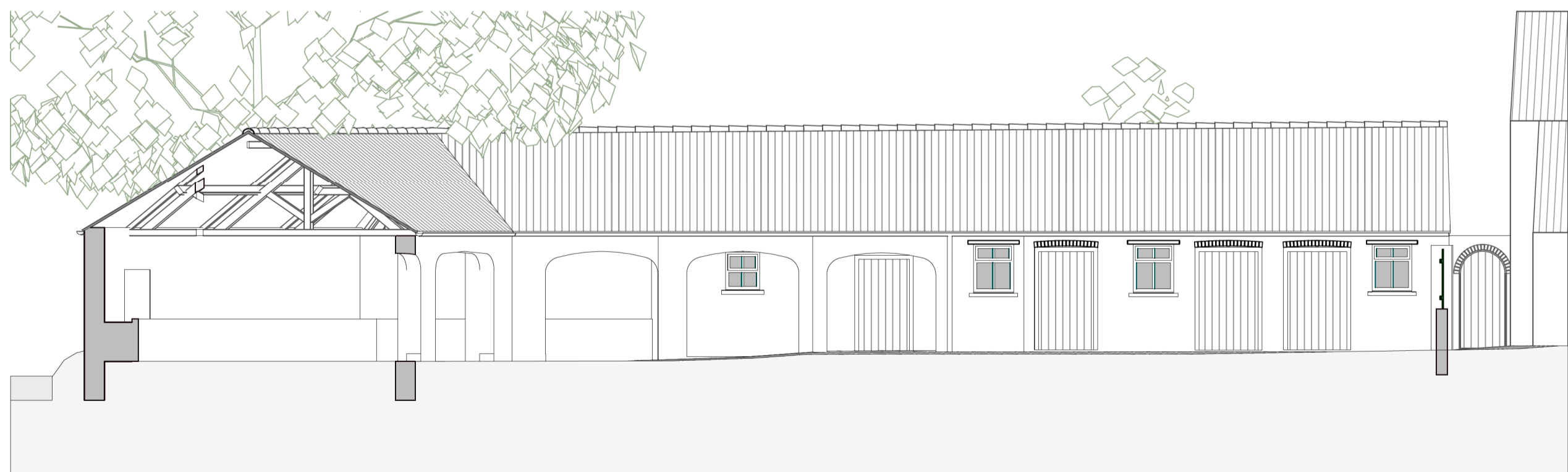
Yard Section L, West Elevation Yard 1:100