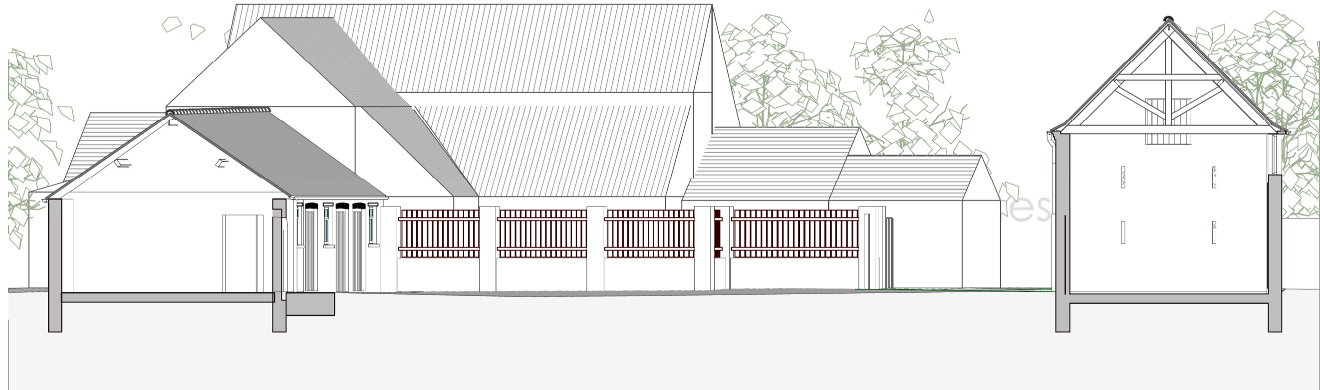
Yard Section K 1:100