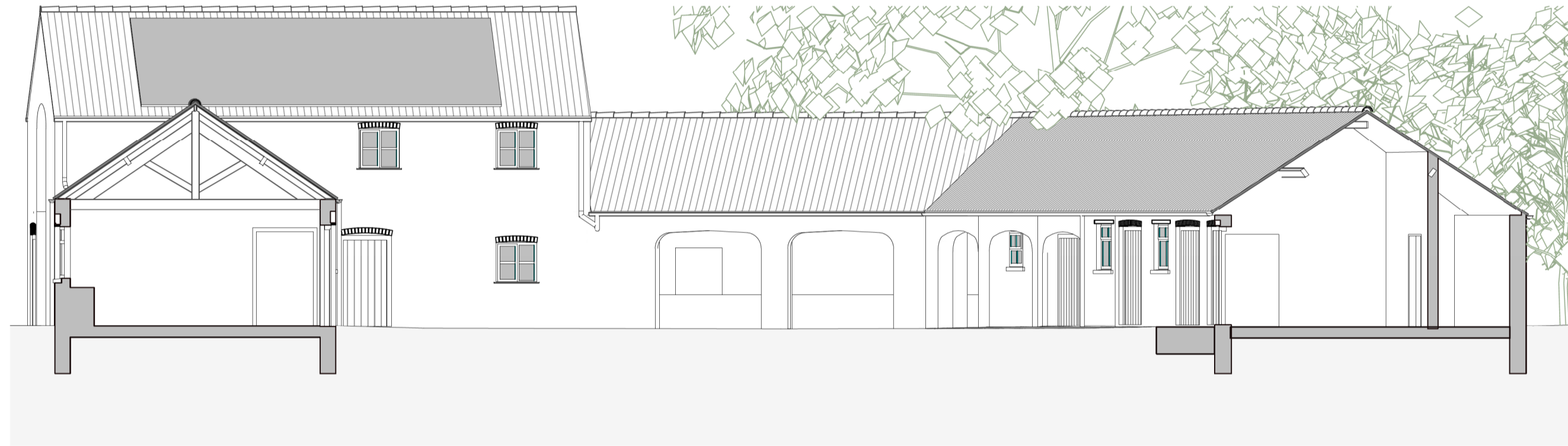
Yard Section H, South Elevation Yard 1:100