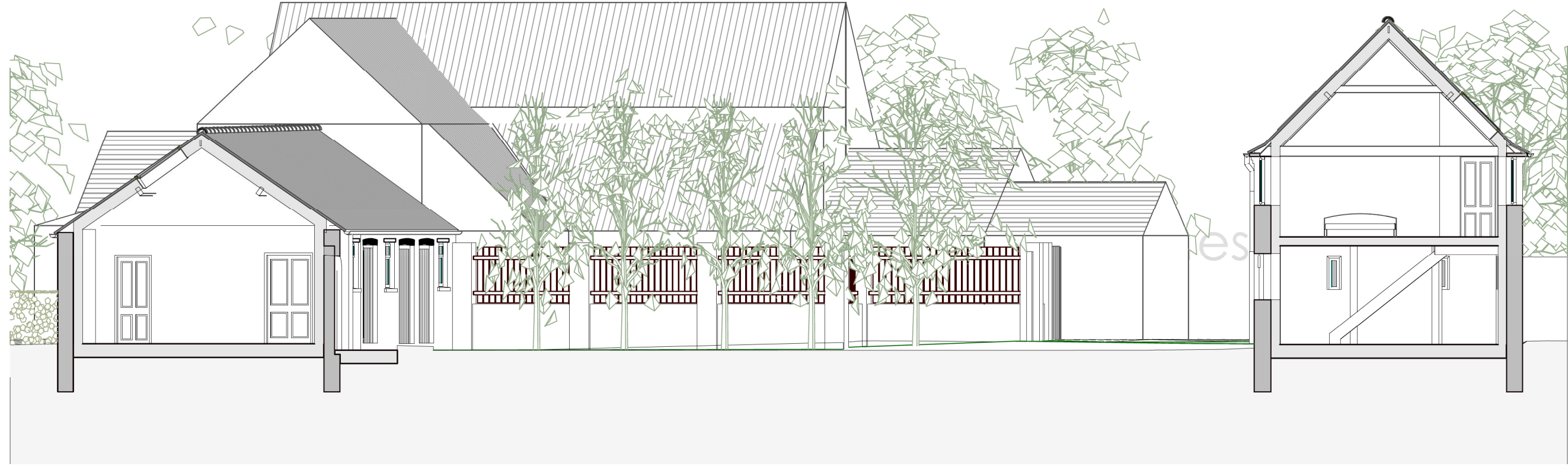
Yard Section K 1:100