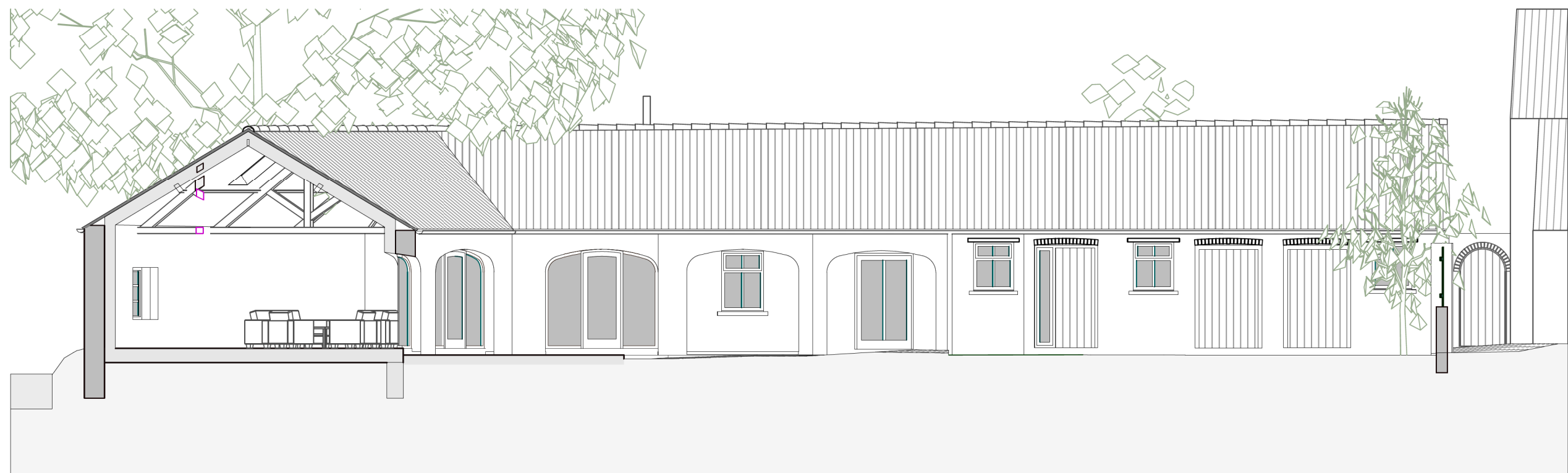
Yard Section L, West Elevation Yard 1:100