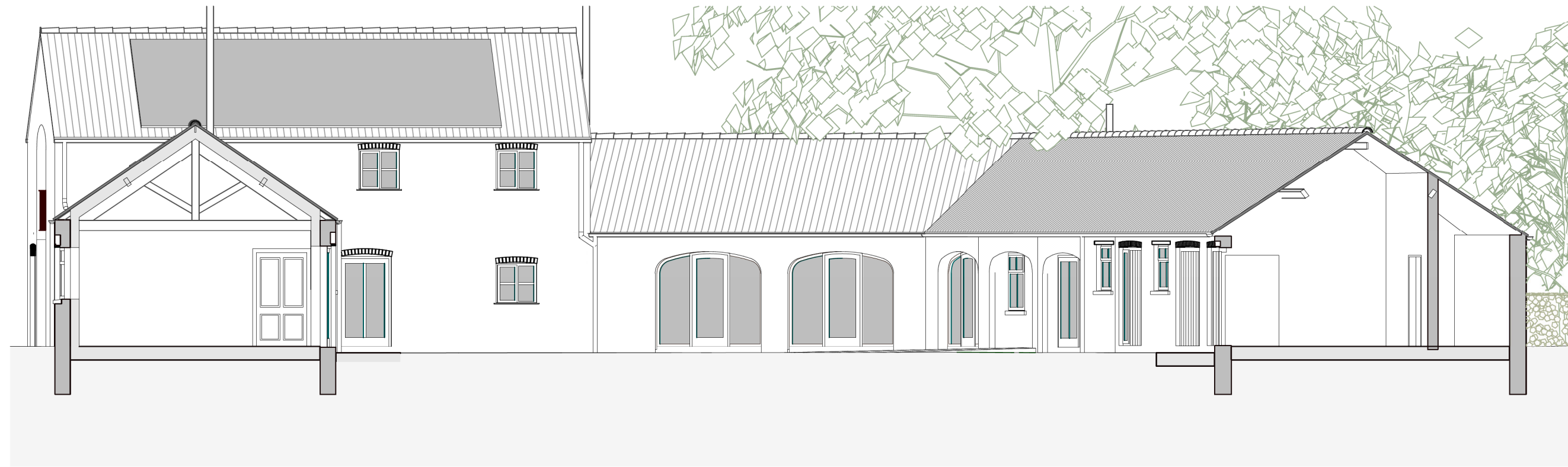
Yard Section H, South Elevation Yard 1:100