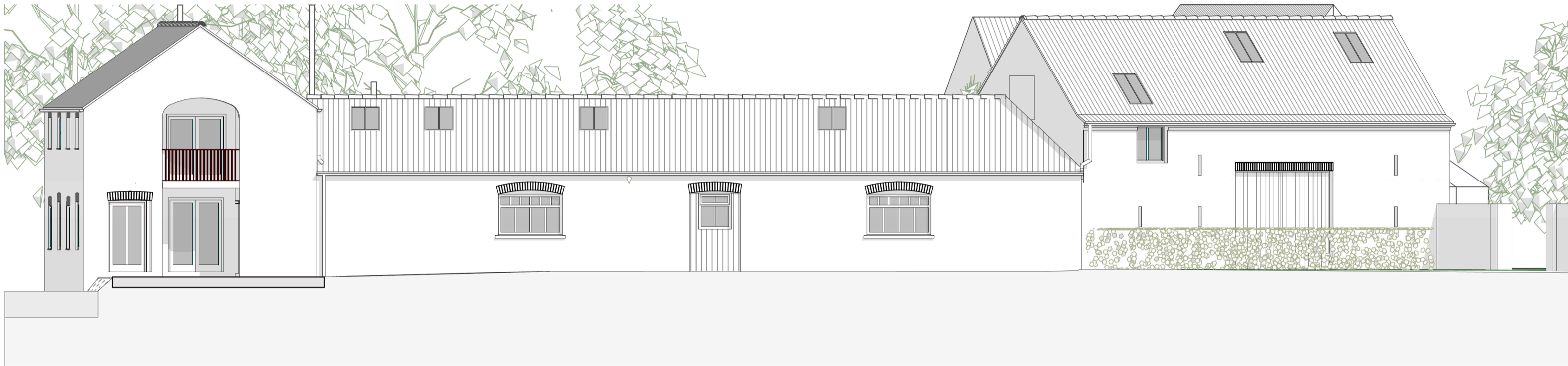
West Elevation 1:100