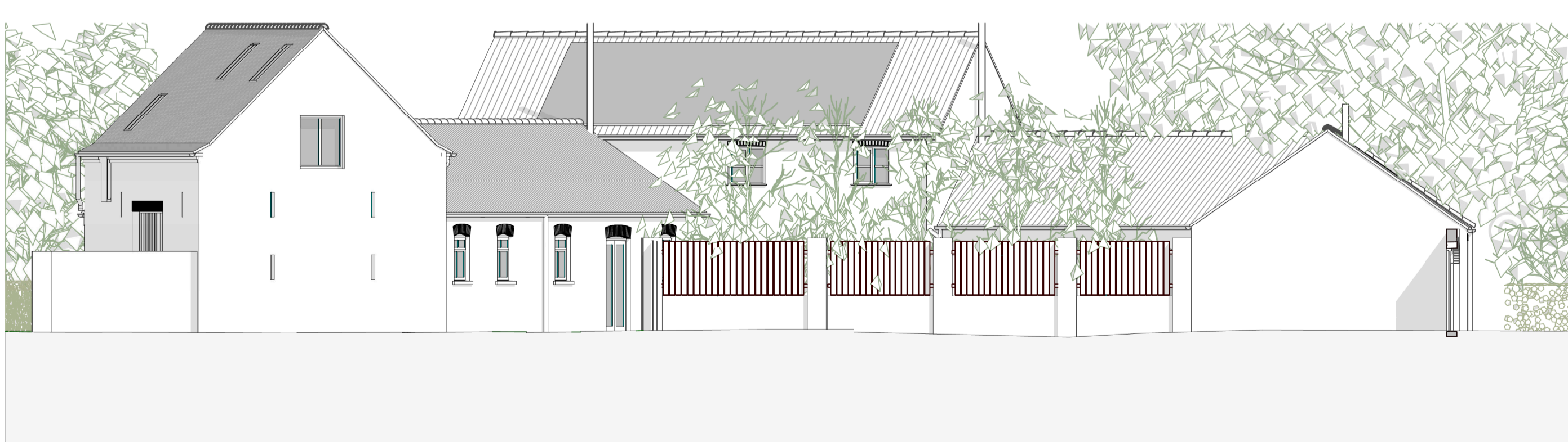
South Elevation 1:100