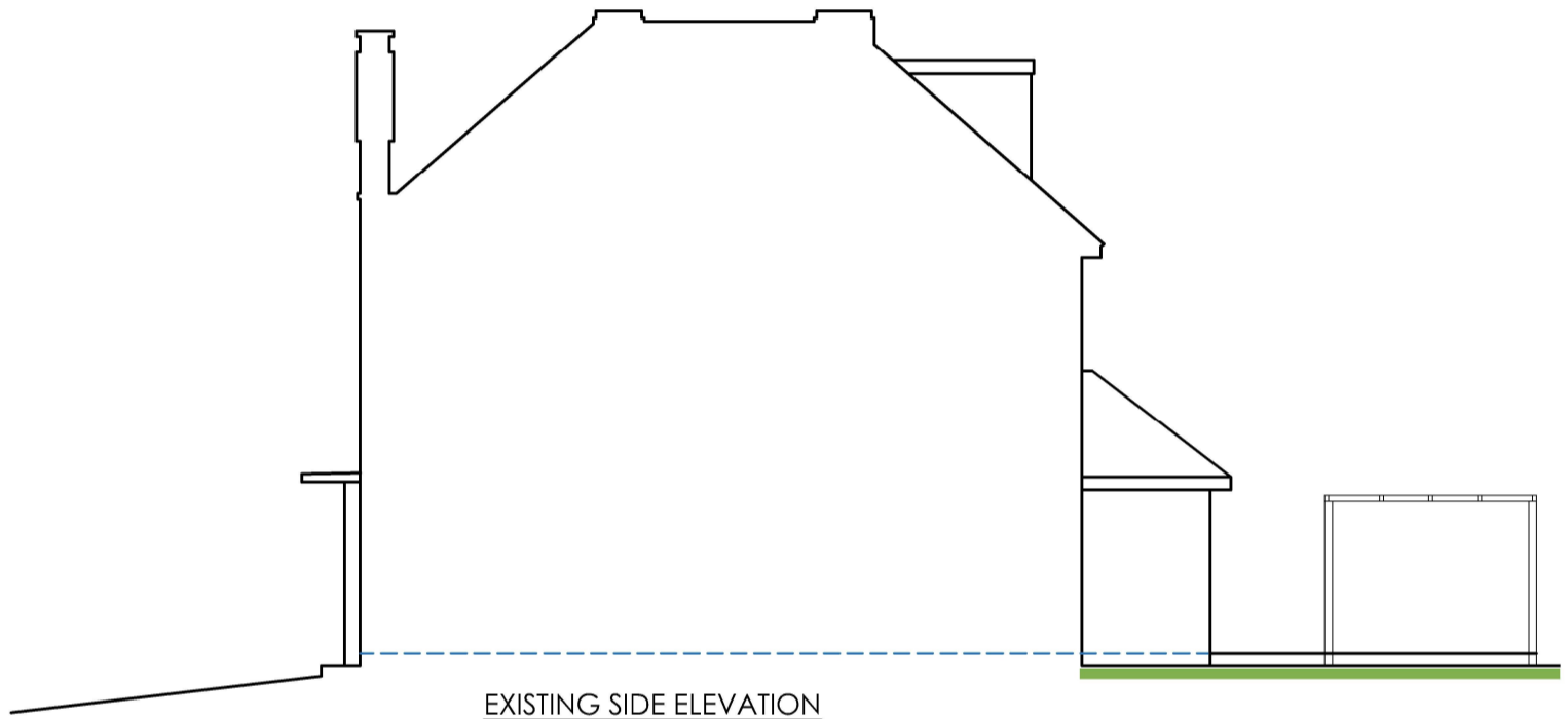
EXISTING SIDE ELEVATION 1:100@A3