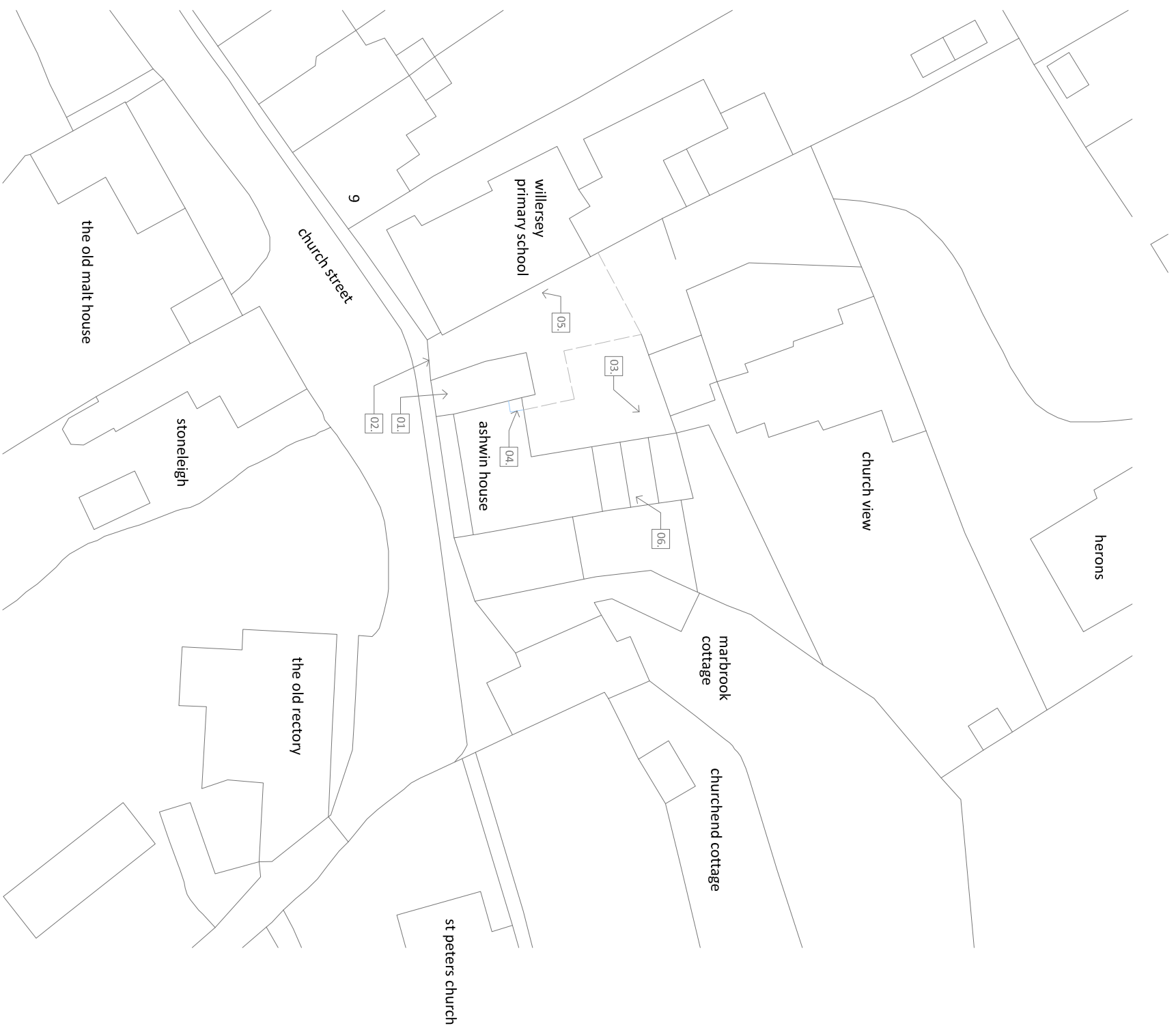
existing block plan 1:500