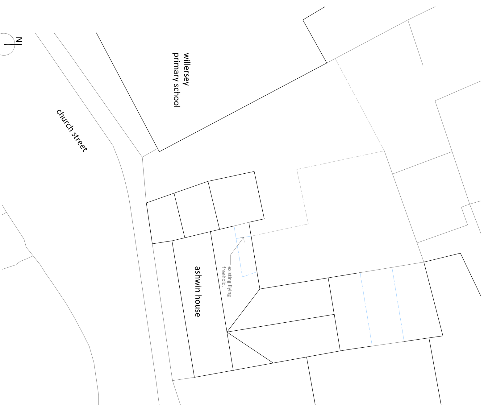
existing block plan 1:200