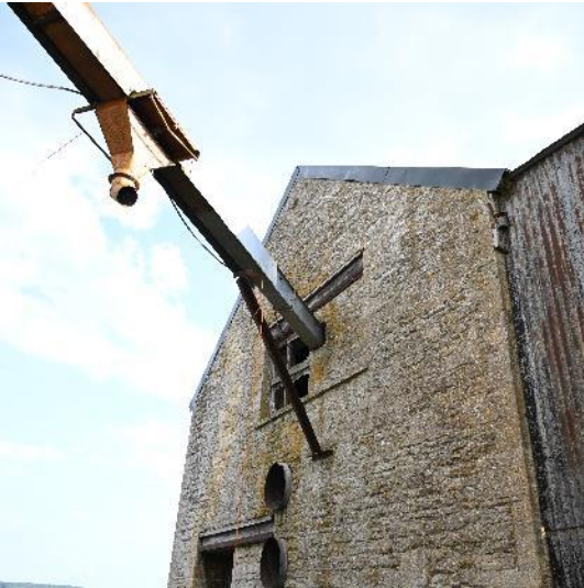
Image 3 Northern wall of large barn