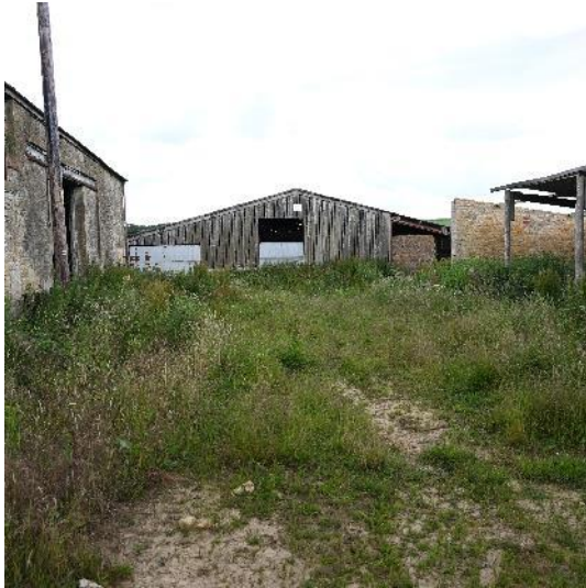
Image 11 Stone barn on left, large modern barns north of site