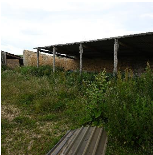
Image 10 Small open fronted sheds east of stone barn