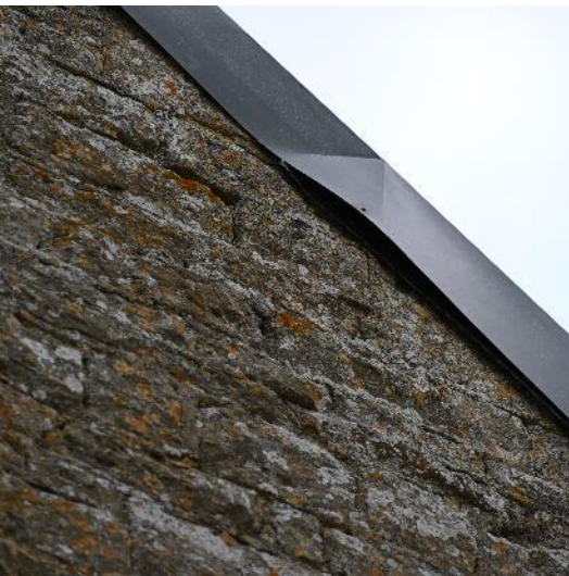
Image 4 PRF high up on roof fascia