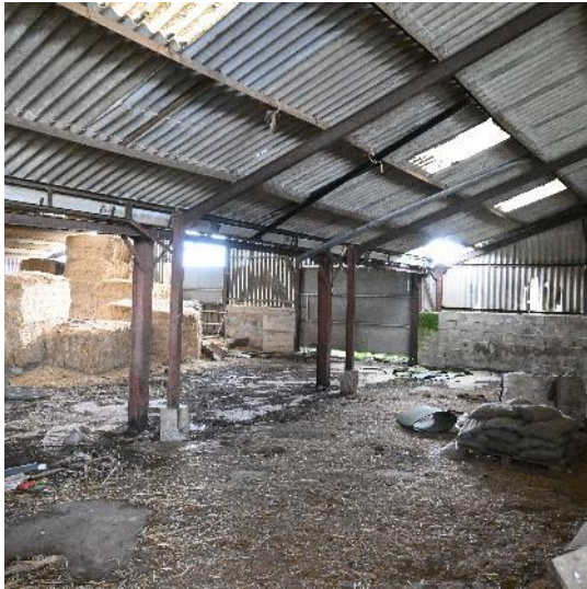
Image 5 Internal structure of other barns