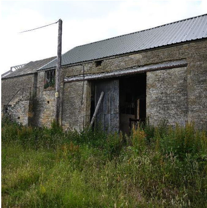
Image 1 Large stone built barn with double doors