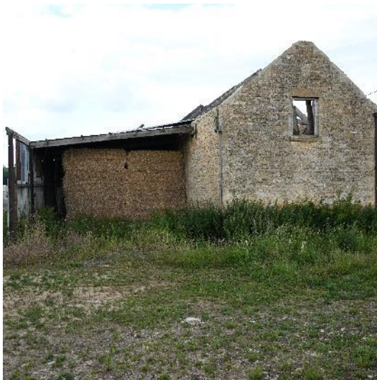
Image 12 Southern end of large stone barn with corrugated metal lean too