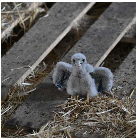
Image 7 Kestrel fledgling