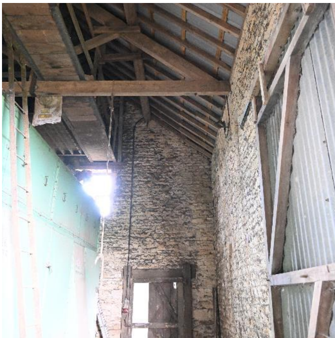
Image 2 Internal structure of large barn with ambient light