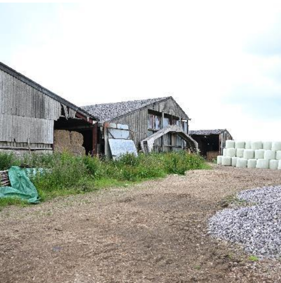
Image 5 Other barns on site