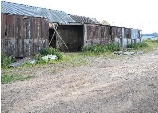
Image 8 Smaller sheds