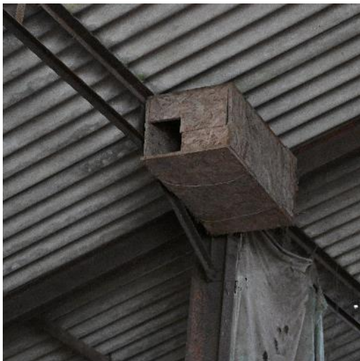
Image 6 Barn Owl box in image 5