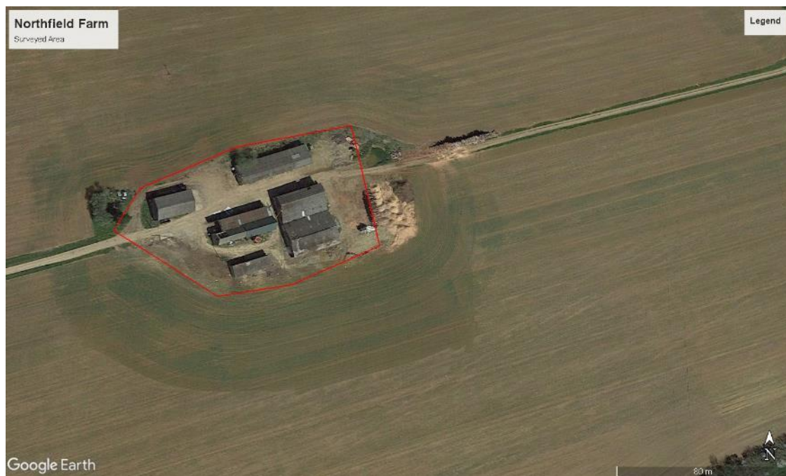
FIGURE 1. Surveyed Area indicated by the red line above.