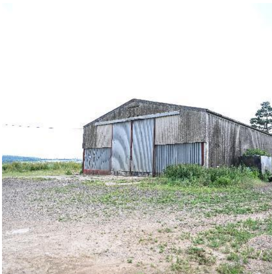
Image 9 Stand-alone tractor shed