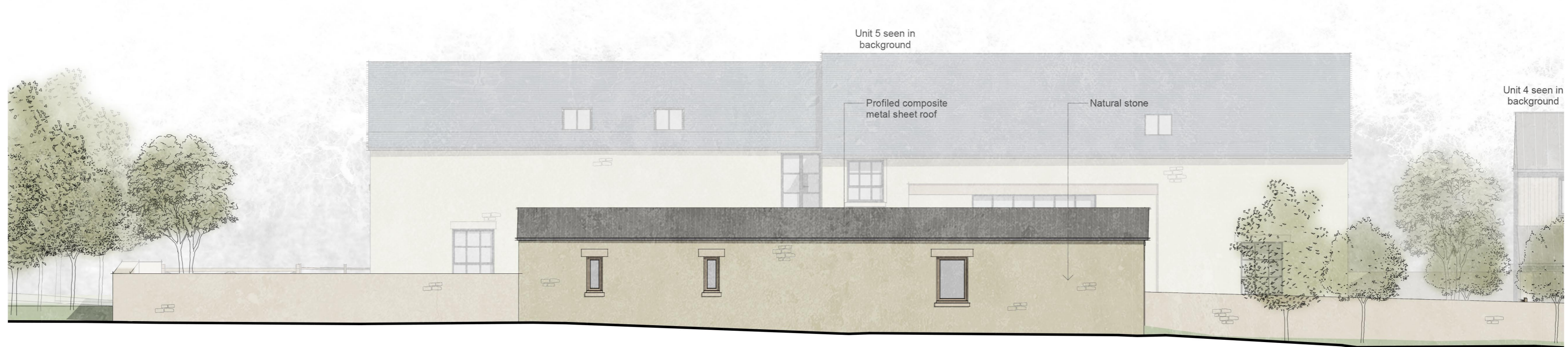
Unit 5 Studio - South Elevation

Planning This drawing has been prepared for workstages up to planning application purposes only and is not intended "for construction". The 'scale bar' should only be used to check the drawing has been reproduced to the correct size. No responsibility can be accepted for errors made by others in "scaling" from this drawing.