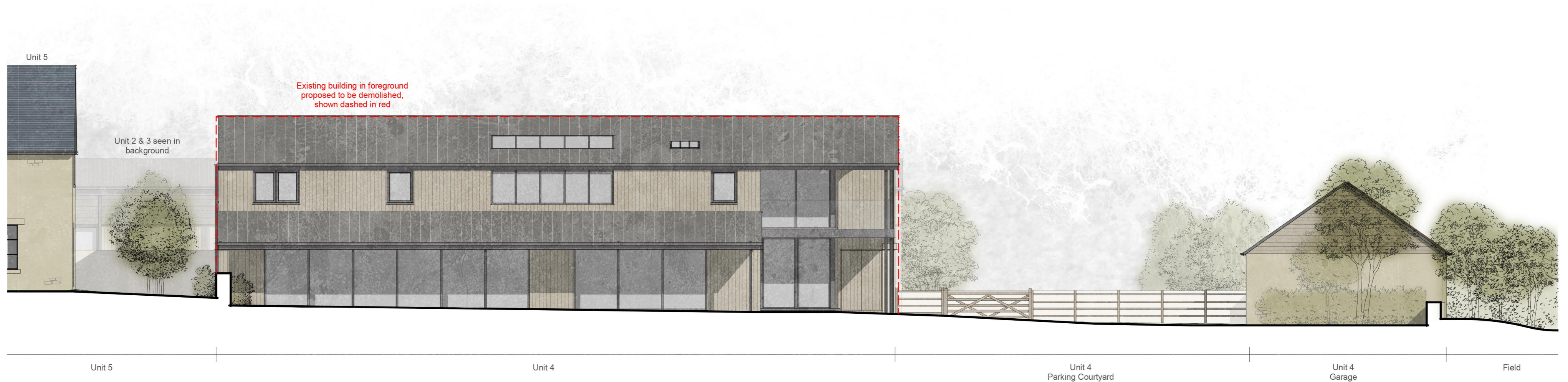
Unit 2 - South Elevation